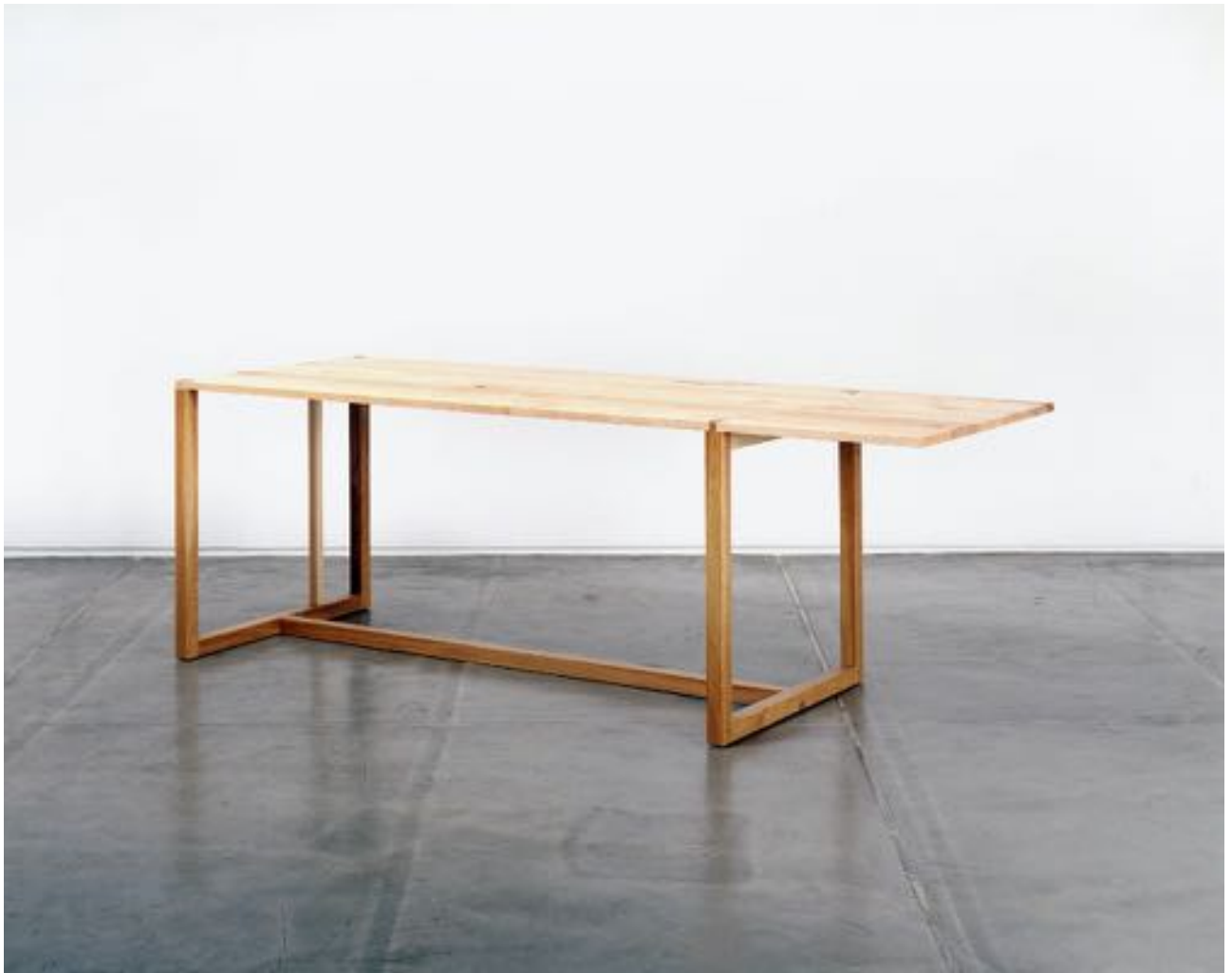
Zelkova Table Zelkova 155W x 55D x 74H cm 2009