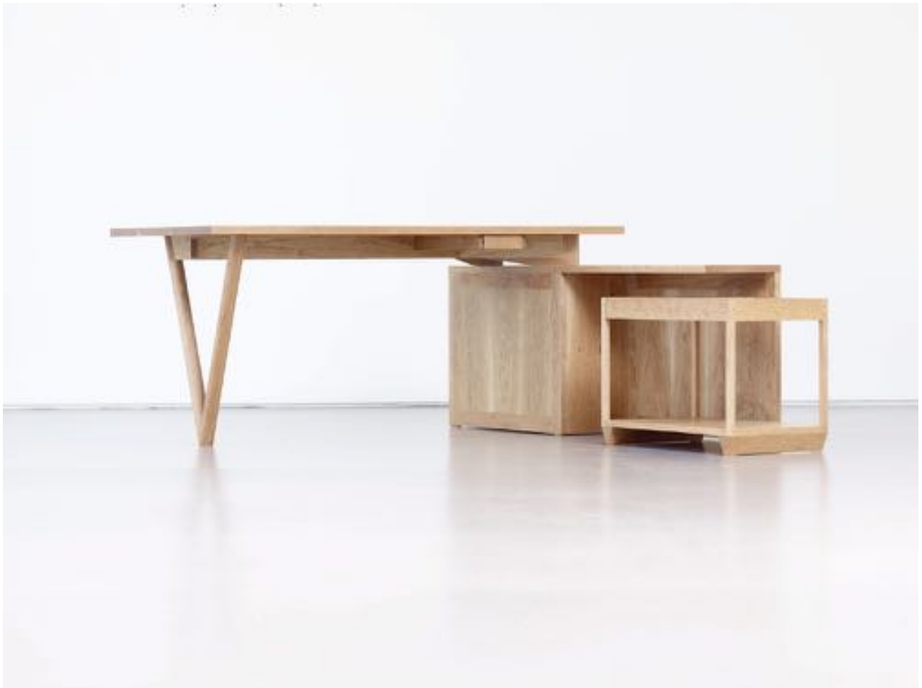
Trans L-C 2011-01 Cherry 180W x 160D x 74H cm 2011