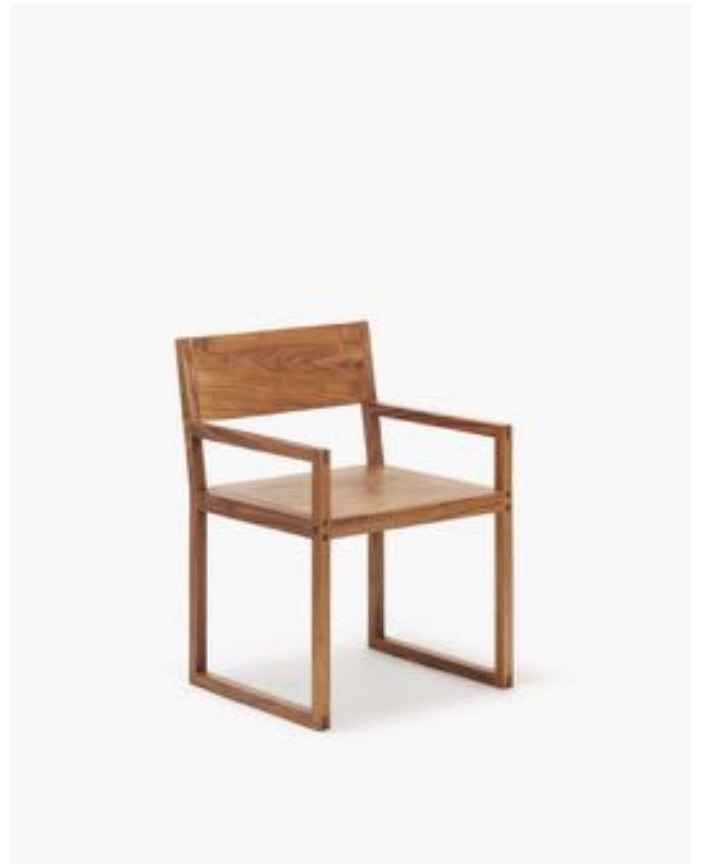
Walnut Armchair Walnut 55W x 56D x 80.5H cm 2009