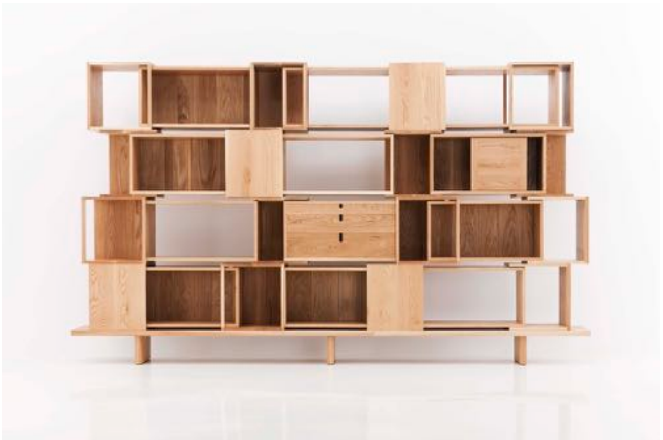
Trans-13-001 White oak 320W x 40D x 187H cm 2013