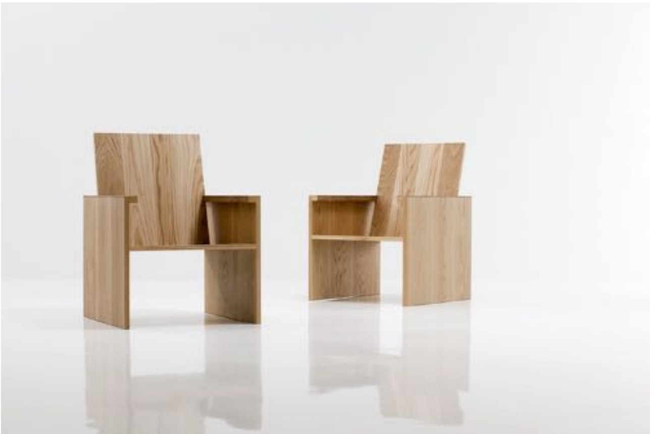
Chair / Bench