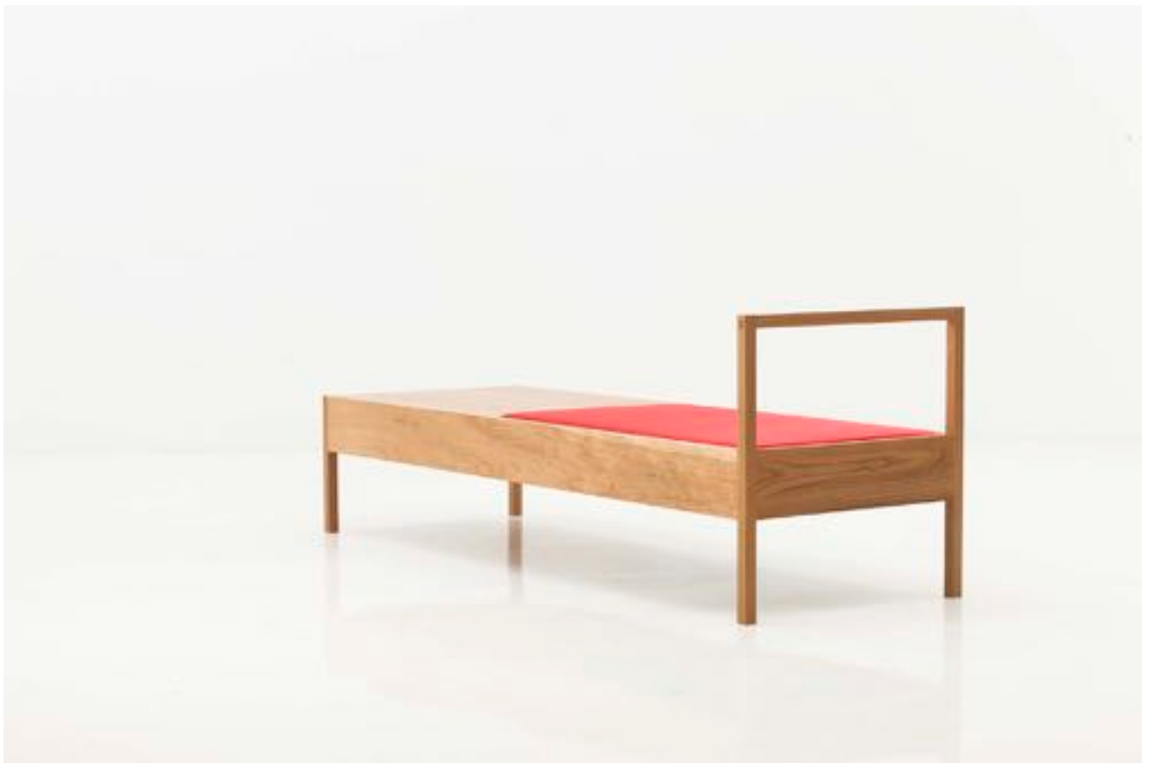
Trans-14-005 Cherry, Red silk 180W x 63D x 66H cm 2014