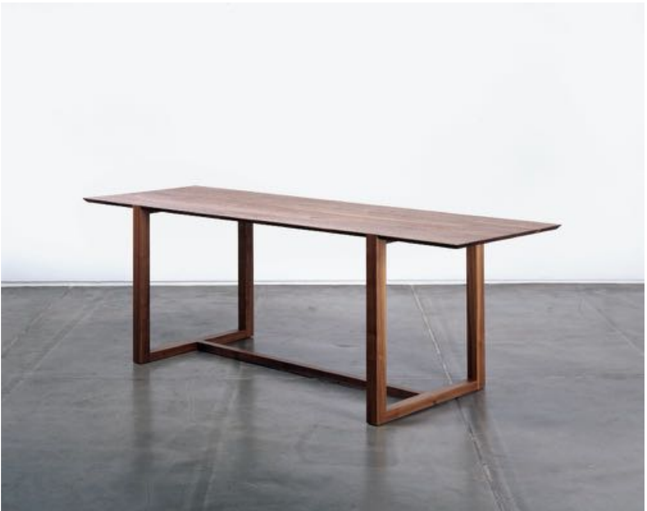
Walnut Table Walnut 225W x 74D x 74H cm 2009