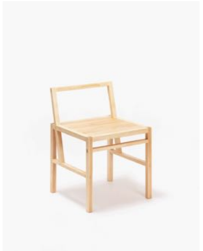
Maple Chair Maple 47W x 47W x 68H cm 2009