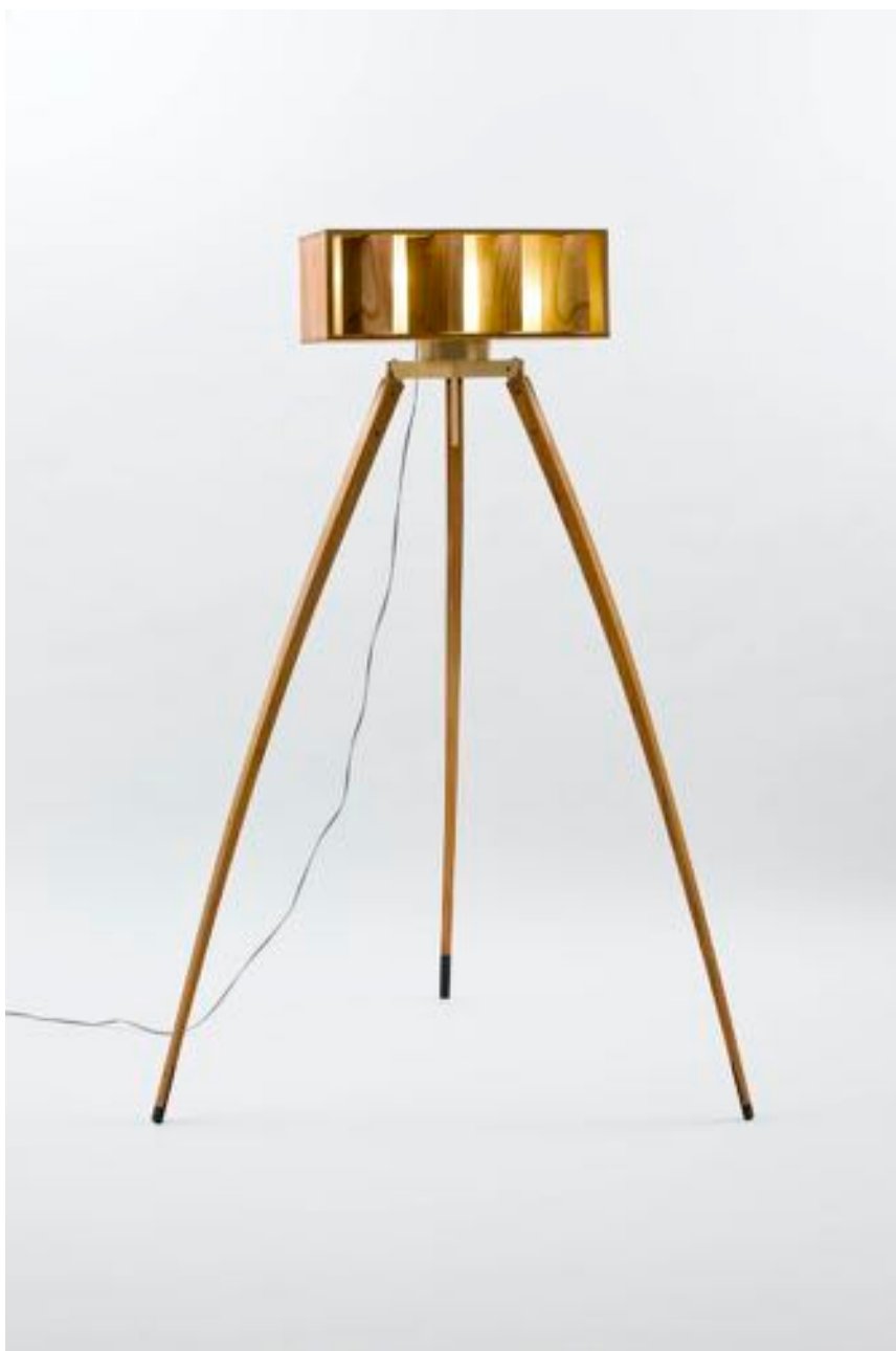
Trans-1004 Cherry, Zelkova, Brass 80W x 80D x 156H cm 2010