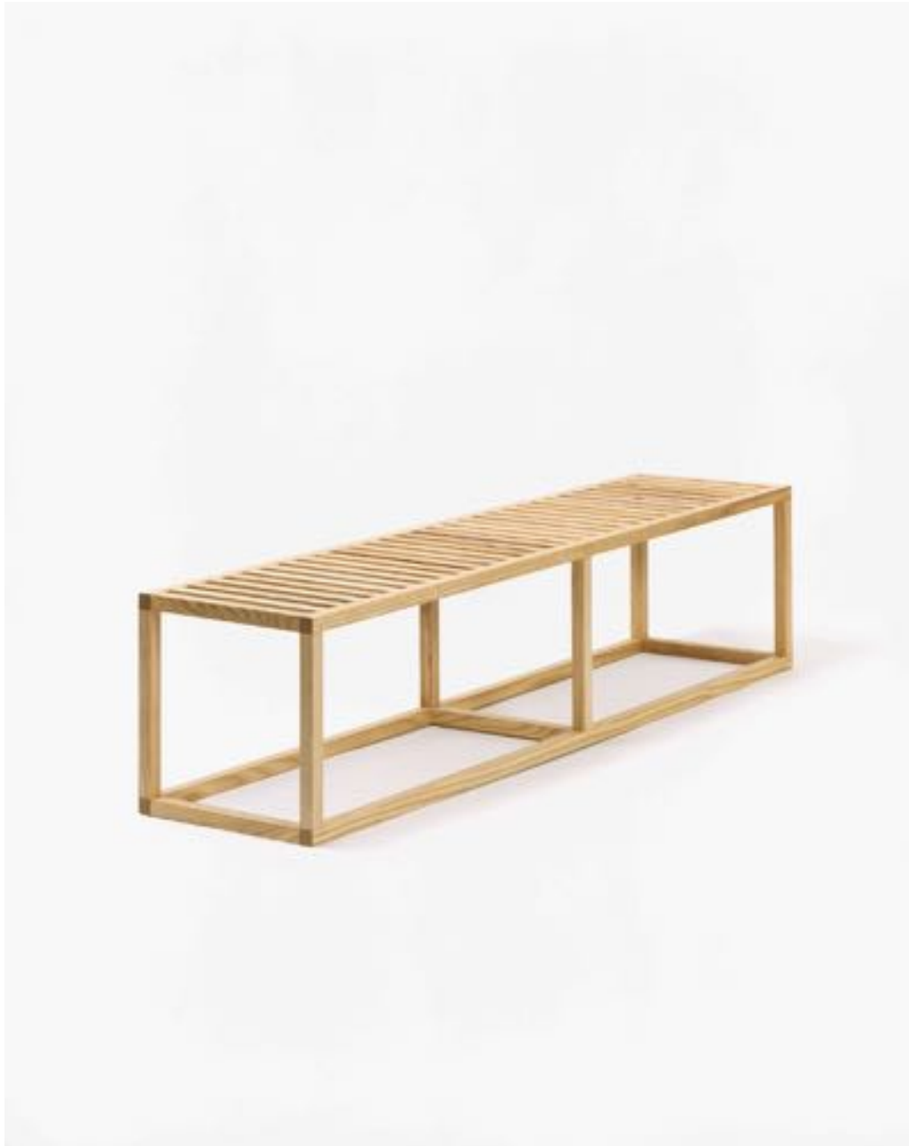
Ash Bench Ash 182W x 43D x 43H cm 2009