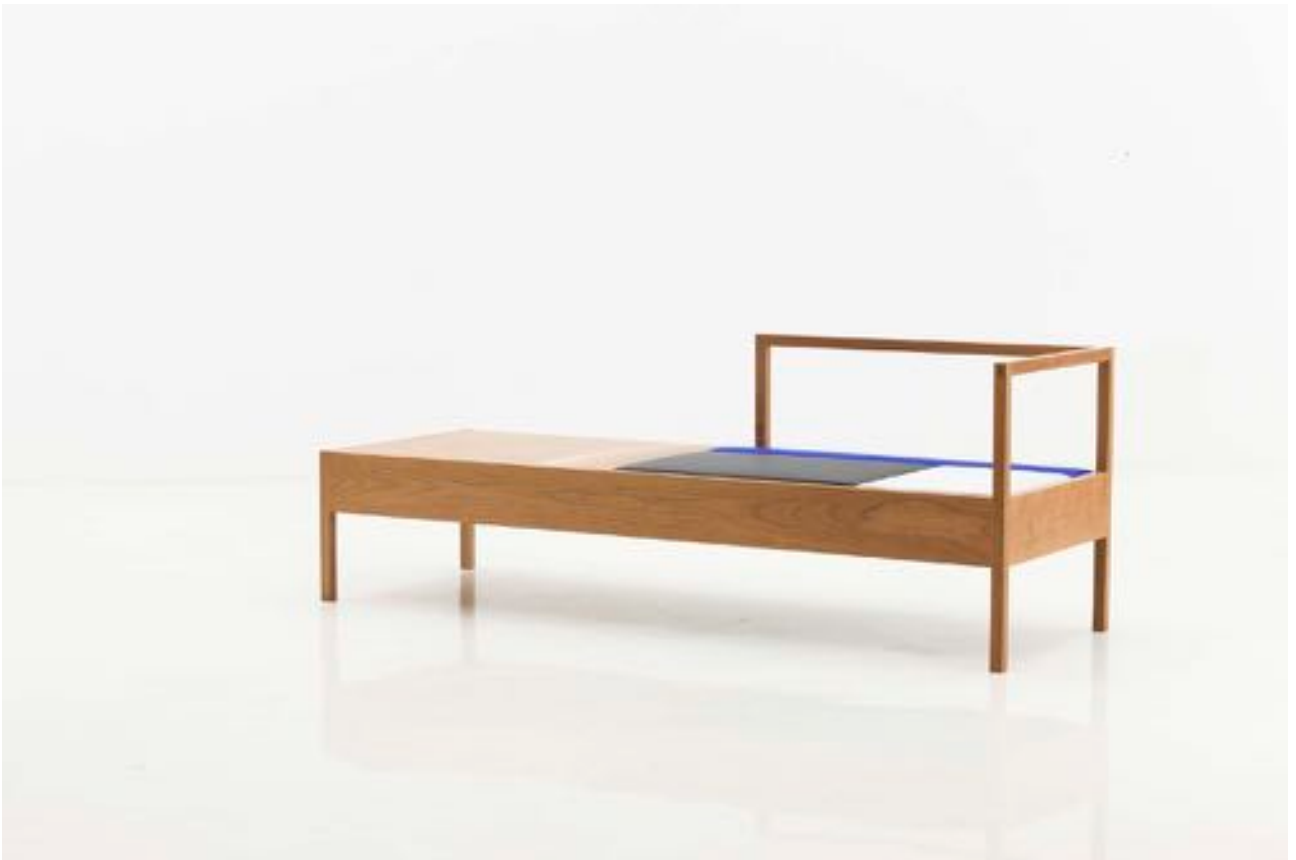
Trans-14-006 Cherry, Black, Blue, White Silk 180W x 63D x 66H cm 2014