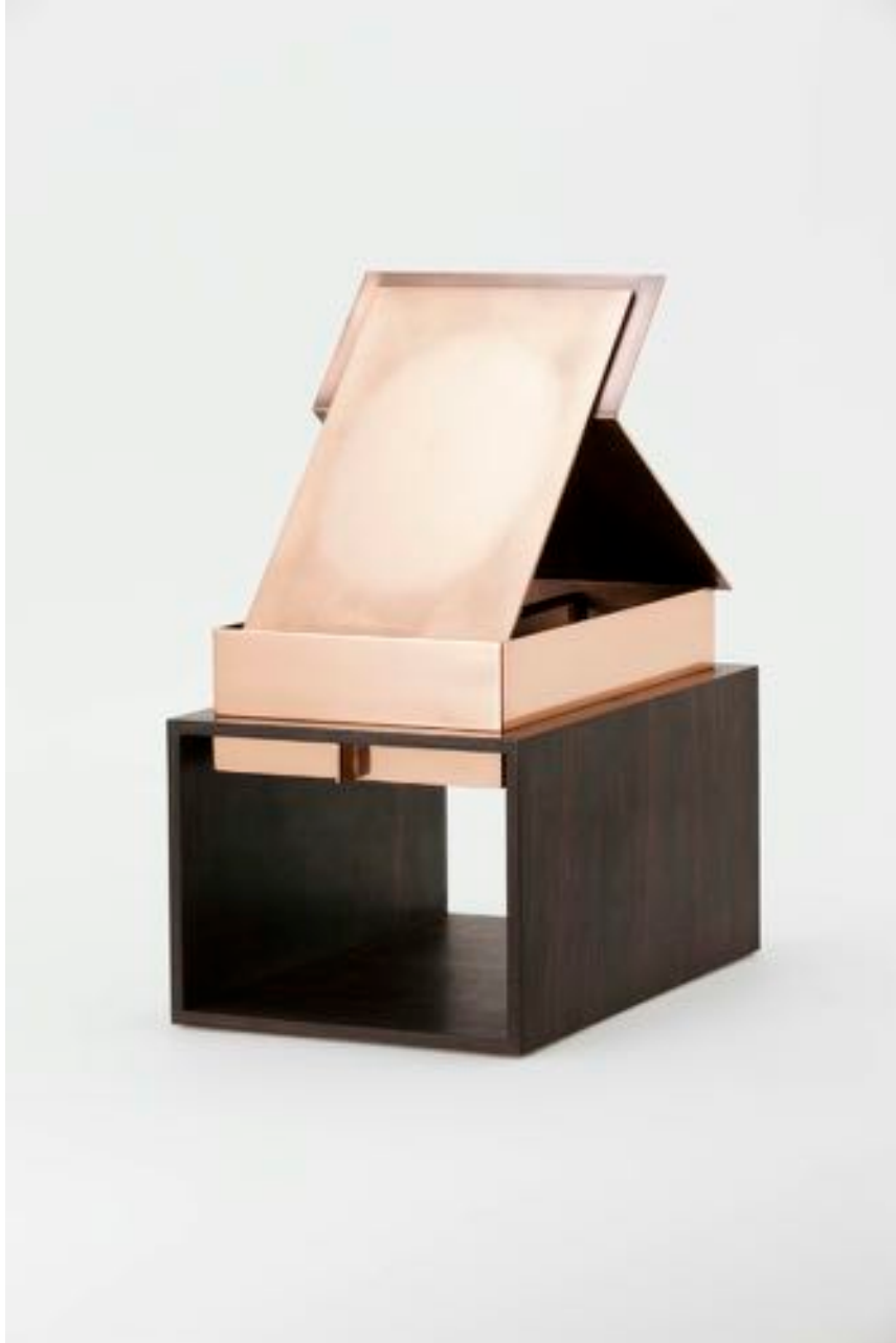
Trans-15Sep-04 Ebony veneer, Red copper, Brass 36W x 24D x 25H, 46H cm 2015