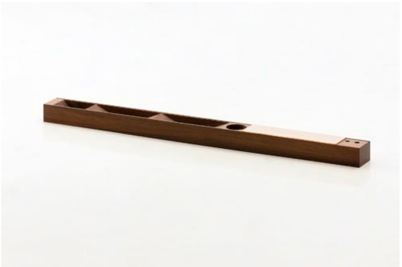
Desk Tray Walnut, Copper 2016