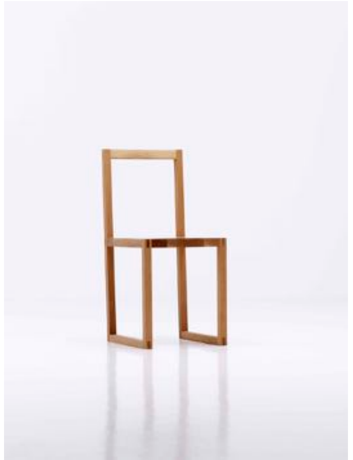
White Oak Chair White Oak 36.5W x 45D x 82H cm 2010