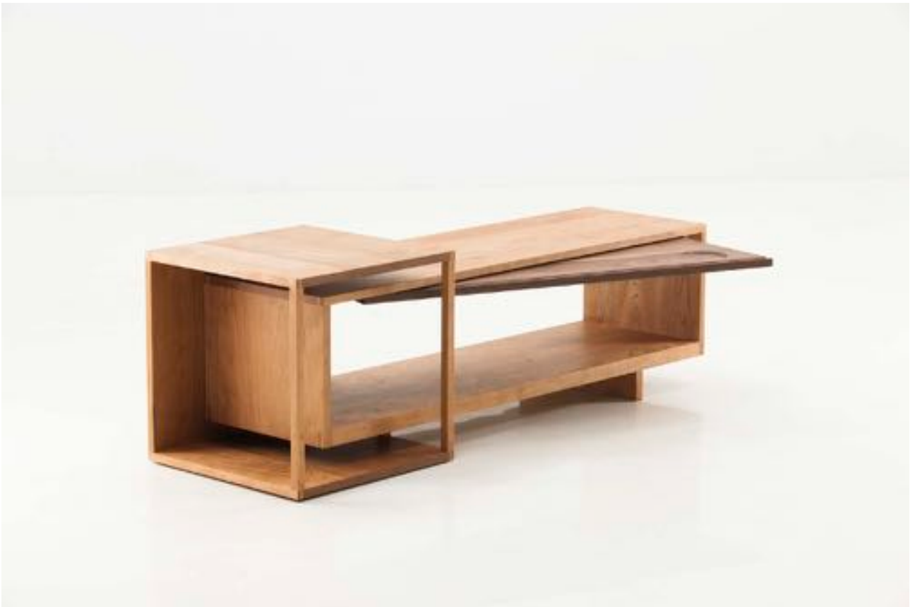
Trans-14-008 Cherry, Walnut, Brass 134W x 44D x 44H cm 2014