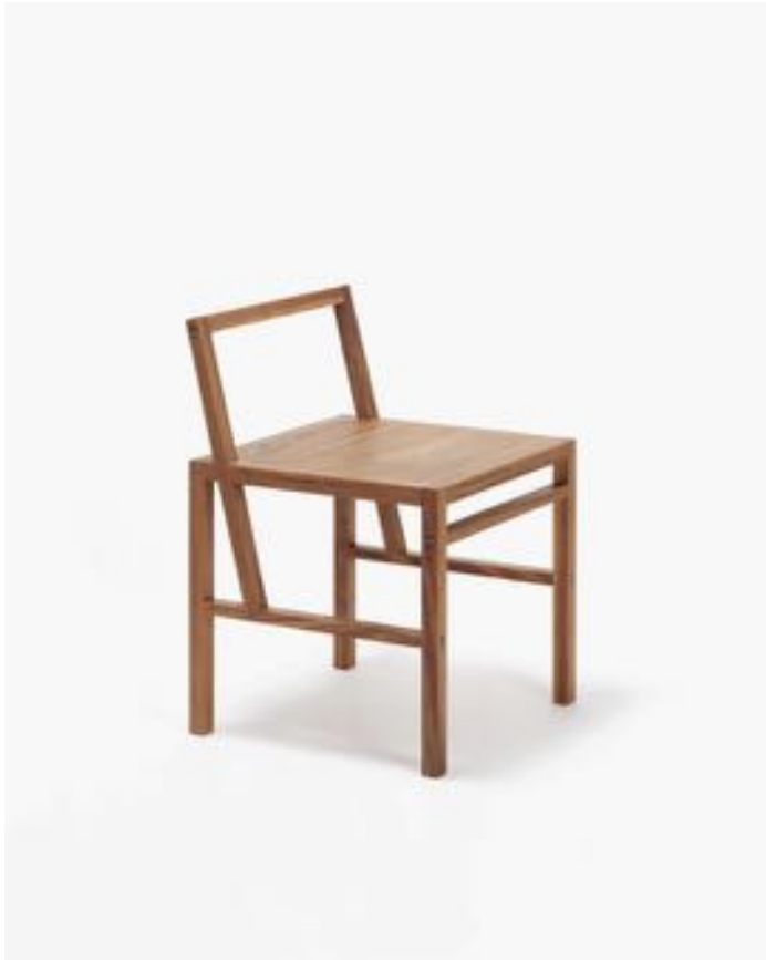
Walnut Chair Walnut 47W x 47W x 68H cm 2009