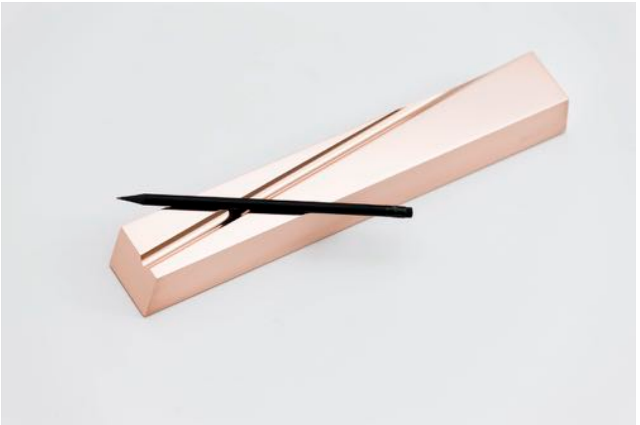
Trans160419 Polished Copper 32W x 5D x 3H cm 2016