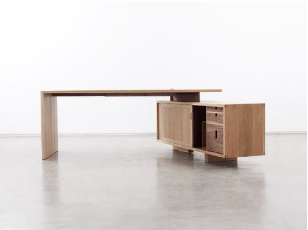
Transpose White oak, Walnut, White Copper 192W x 160D x 73.5H cm 2011