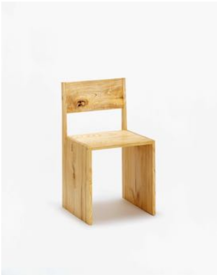
Kalopanax Chair Kalopanax 40W x 39D x 71.5H cm 2009