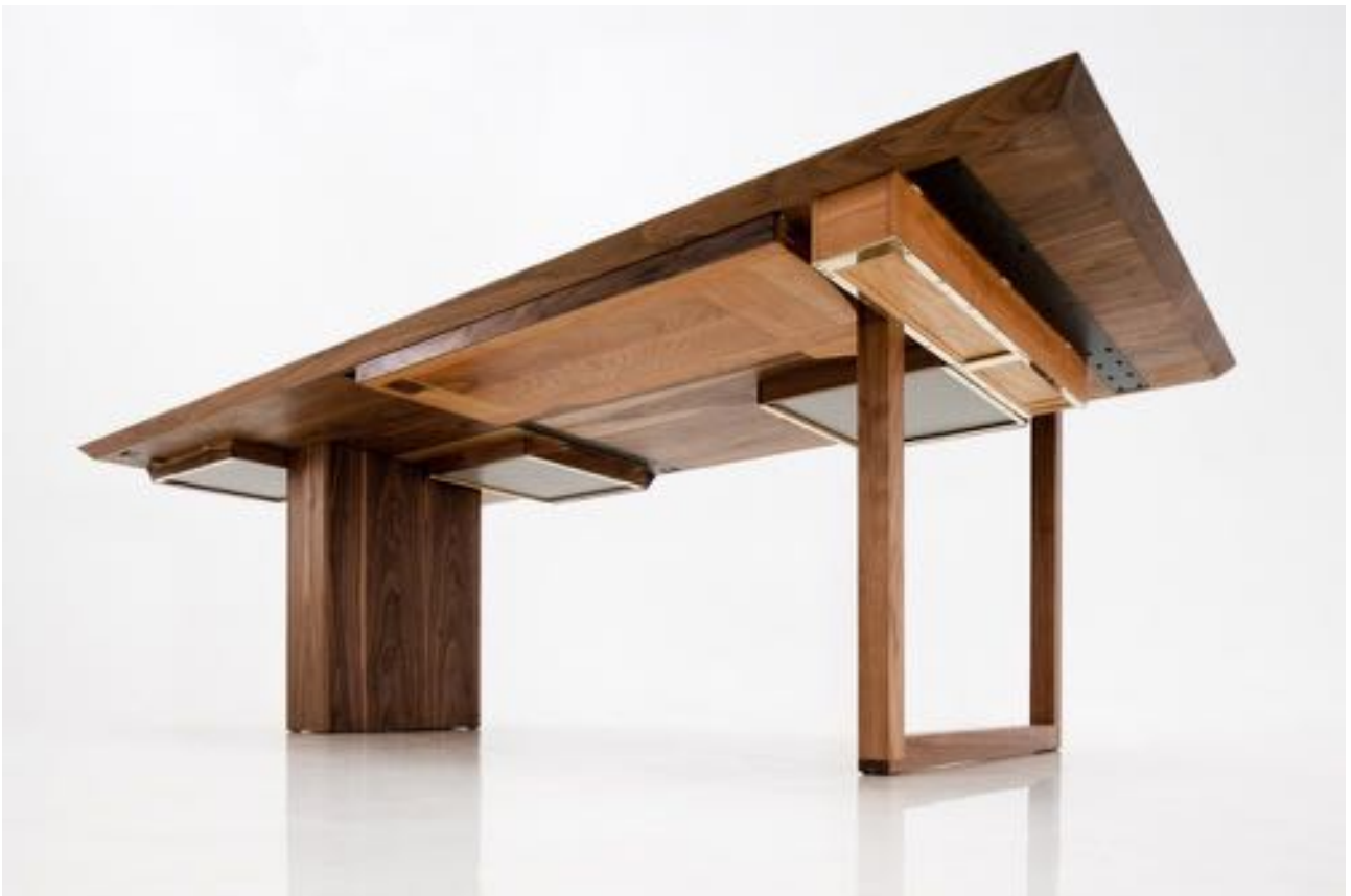
Trans 2015Apr27 Walnut, Copper, Aluminum 250W x 110D x 74H cm 2015