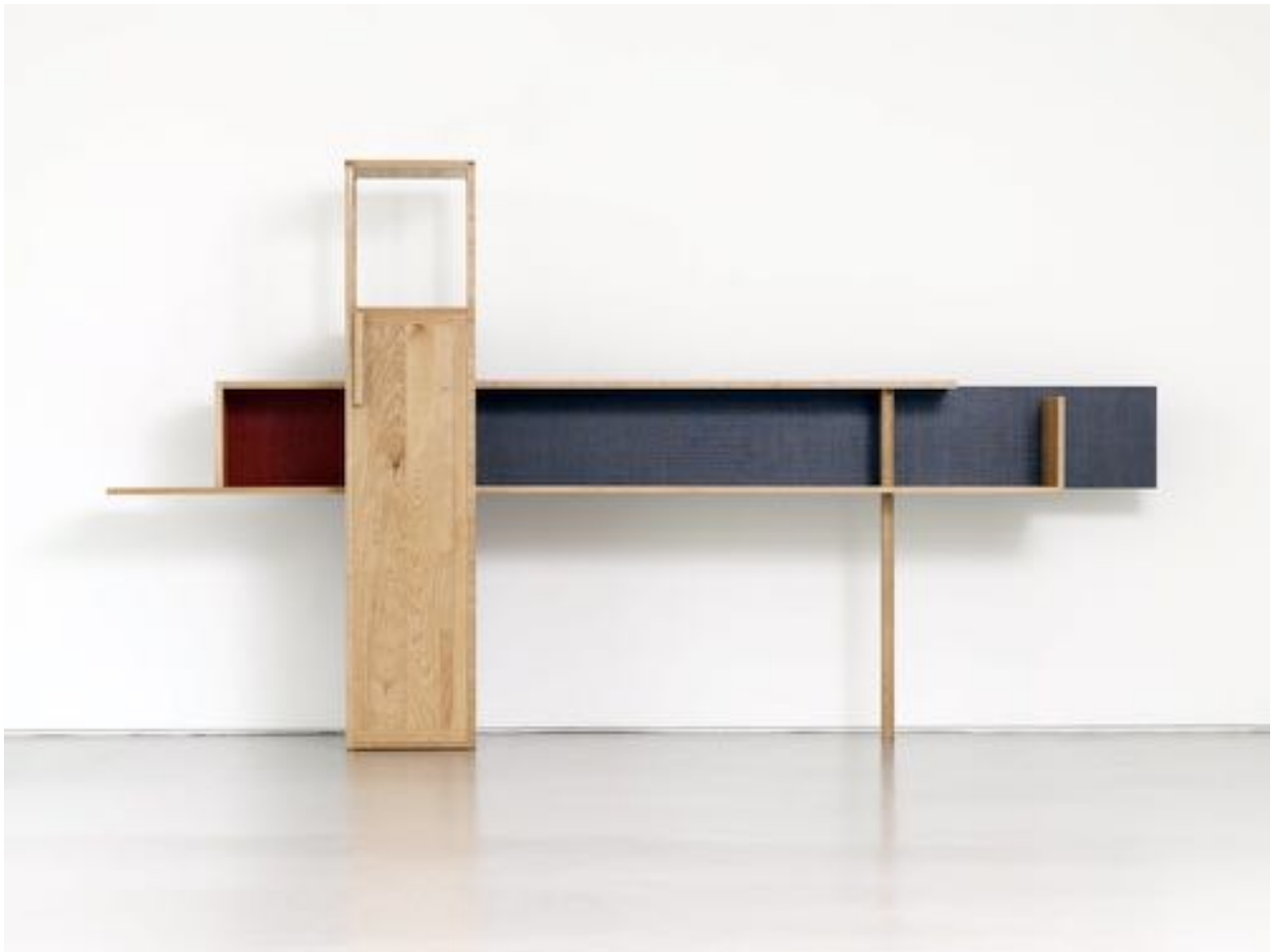
Trans L-C 2011-02 Cherry, Traditional lacquer wood 340W x 50D x 180H cm 2011