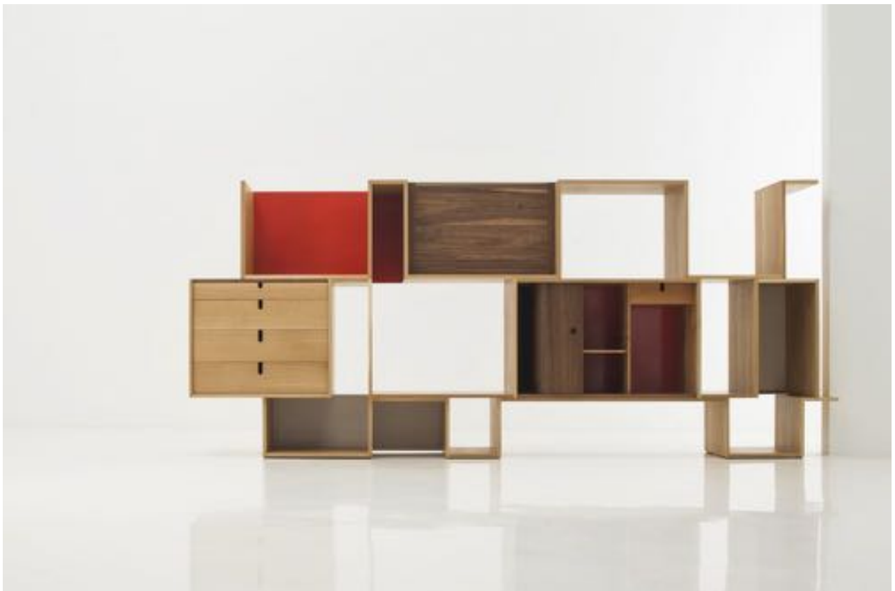
Trans-13-004 White oak , Walnut , Aluminum 303W x 38D x 130H cm 2014