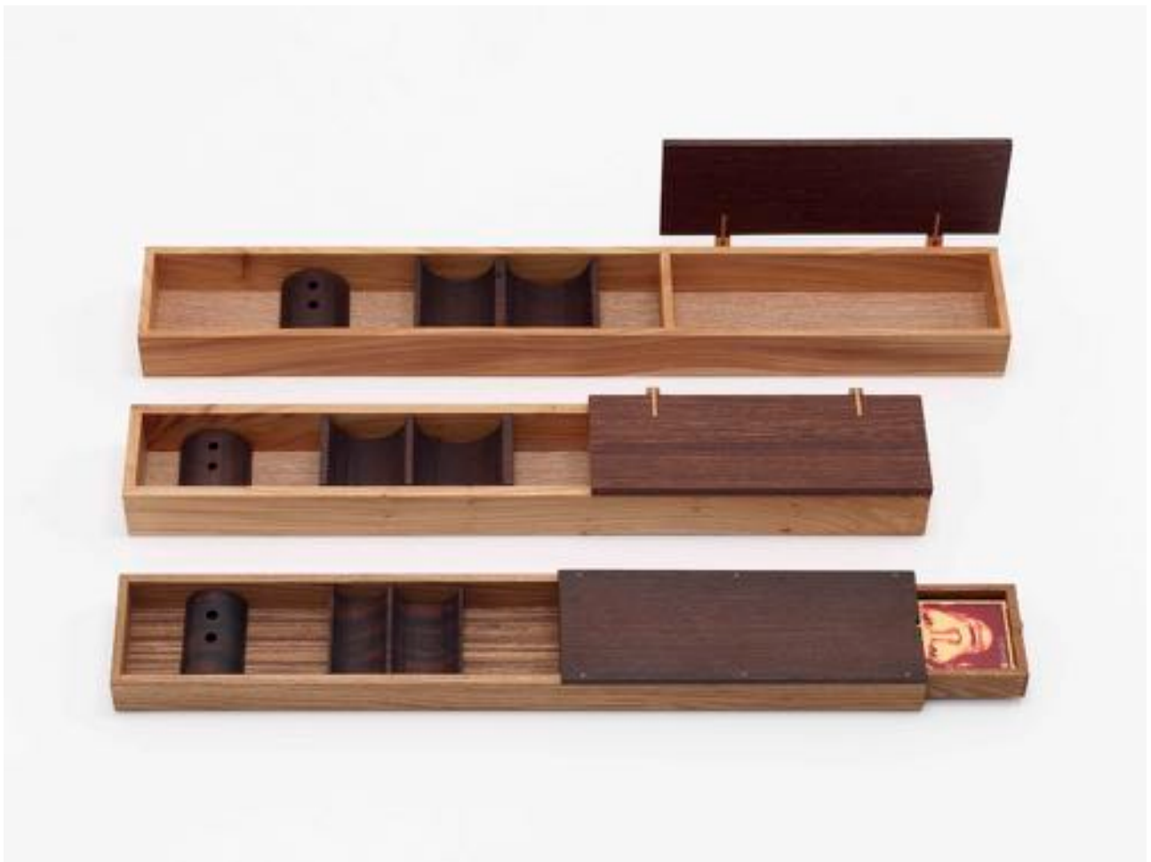
Desk Tray Zelkova, wenge 80W x 11D x 6H cm 2012