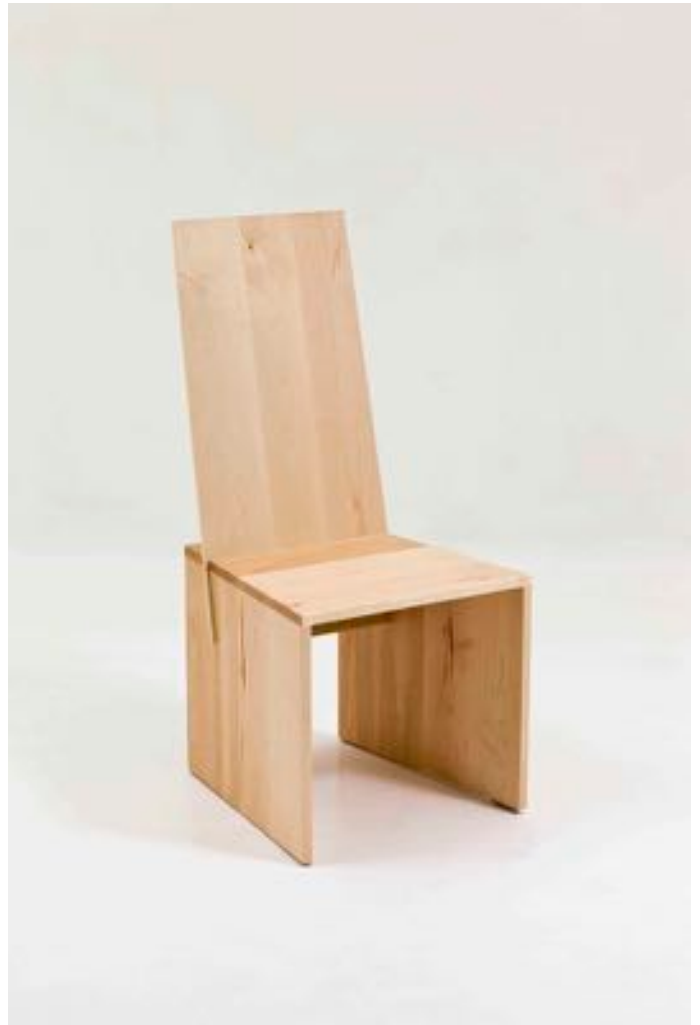
Study Room Chair Maple 48W x 60D x 76H cm 2010