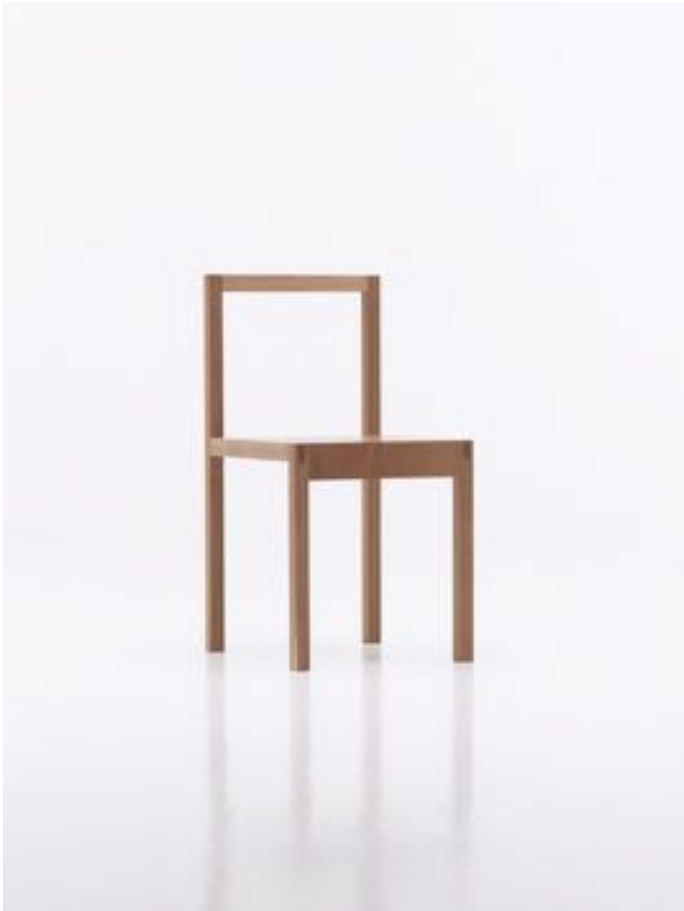
Trans 2012-Chair Cherry 43W x 38D x 75H cm 2012