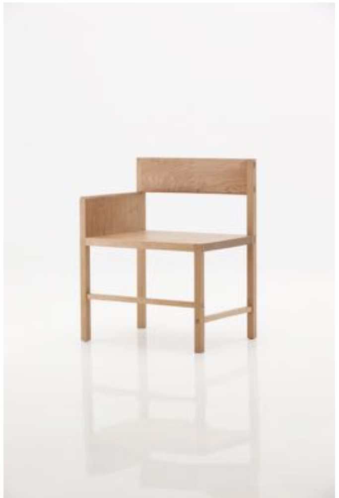
Trans-13-004 Cherry 59.5W x 45D x 76H cm 2013