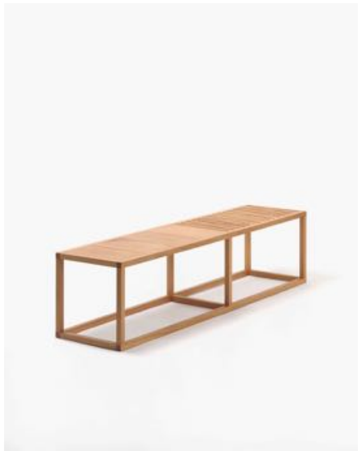
Beech Bench Beech 162W x 40D x 40H cm 2009