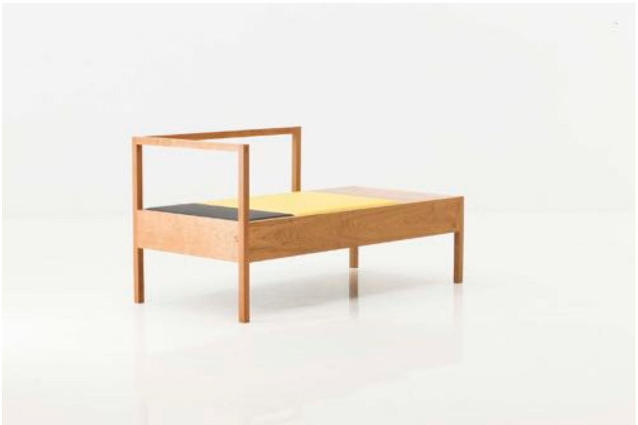
Trans-14-007 Cherry, Black, Yellow silk 129W x 63D x 66H cm 2014