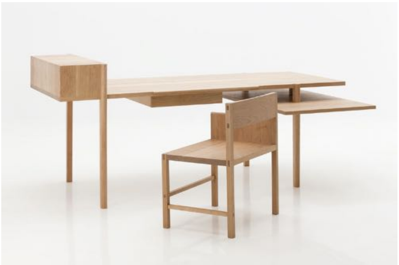
Trans-13-003 Cherry 206.5W x 83D x 93.5H cm 2013