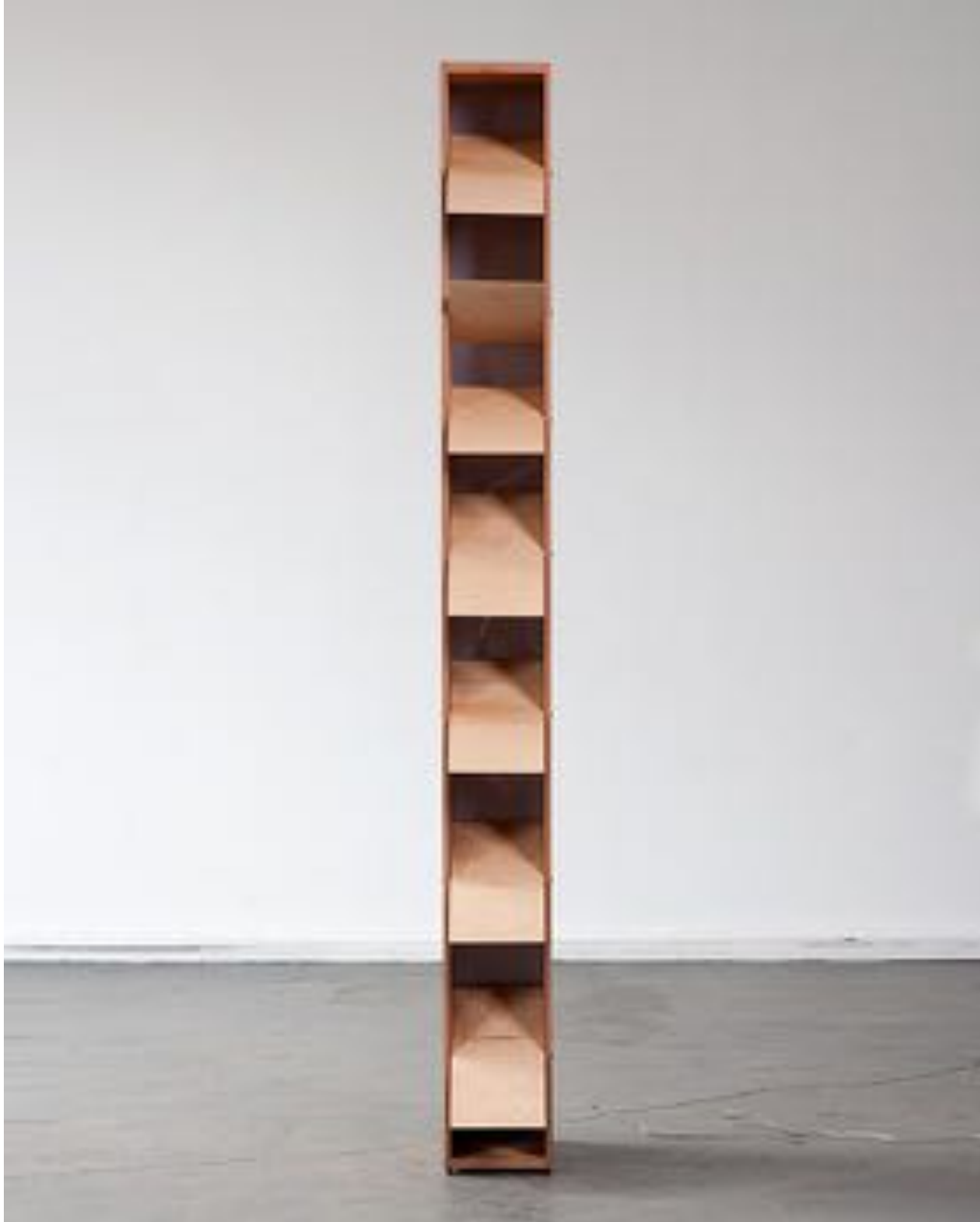
Trans-1003 Cherry 18.5W x 27.5D x 199.5H cm 2010