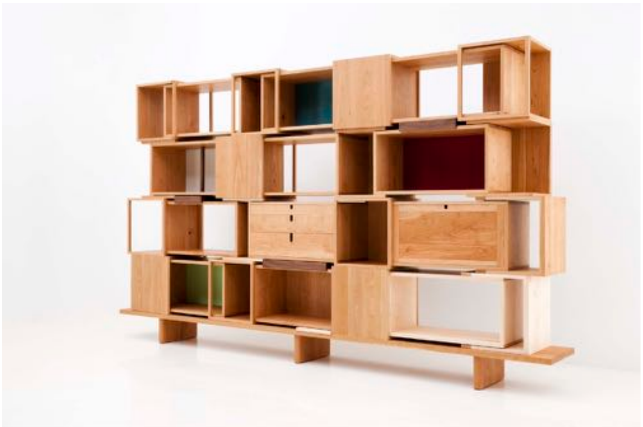
Trans-13-002 Cherry, Maple, Walnut, Aluminium 324W x 40D x 187H cm 2013