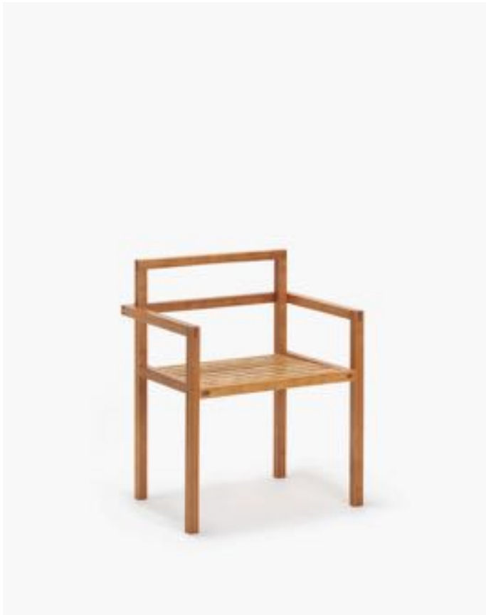
Cherry Armchair Cherry 60W x 48D x 76H cm 2009