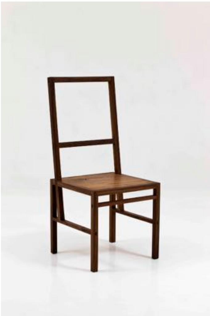
Study Room Chair Walnut 48W x 60D x 76H cm 2010