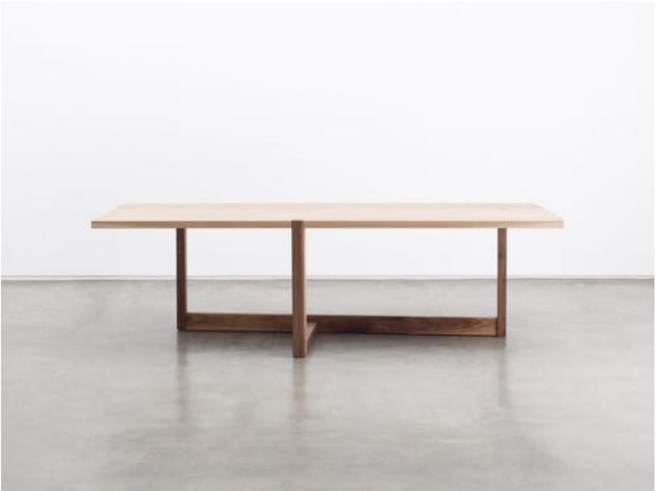
Dining Table White oak, Walnut 243W x 90D x 73H cm 2010