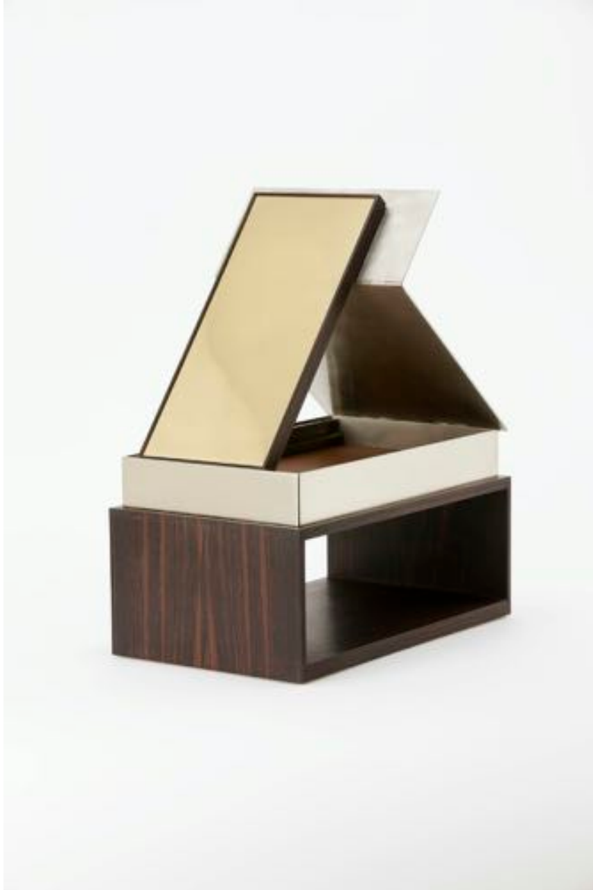
Trans-15Sep-03 Ebony veneer, Solid Mahogany, White copper, Brass 41.5W x 25.5D x 22H, 49H cm 2015