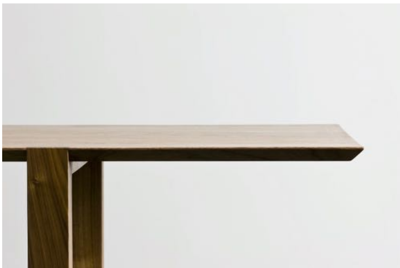
Table / Desk