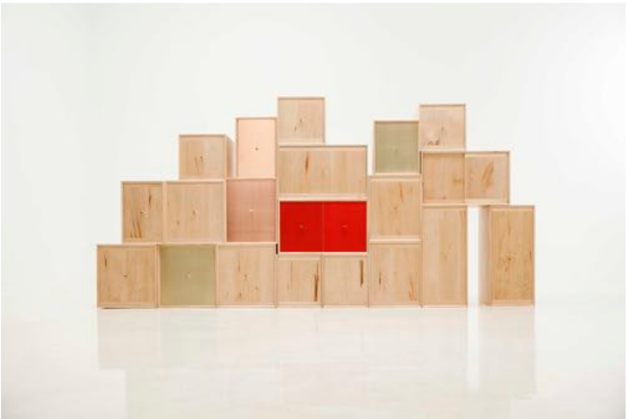
Trans-15Apr-01 Hard Maple, Mirror Polished Copper, Brass, Copper, Colored on Galvanizing Steel, LED, Audio AMP 303.1W x 40D x 145.7H cm 2015