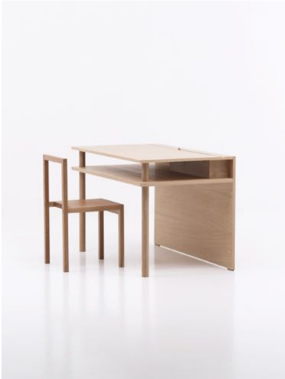
Trans 2012-Desk_S Birch plywood, Sliced oak veneer, Walnut 122W x 68D x 77H cm 2012