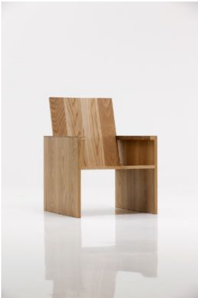
Tranquil A White Oak 62W x 65D x 86H cm 2012