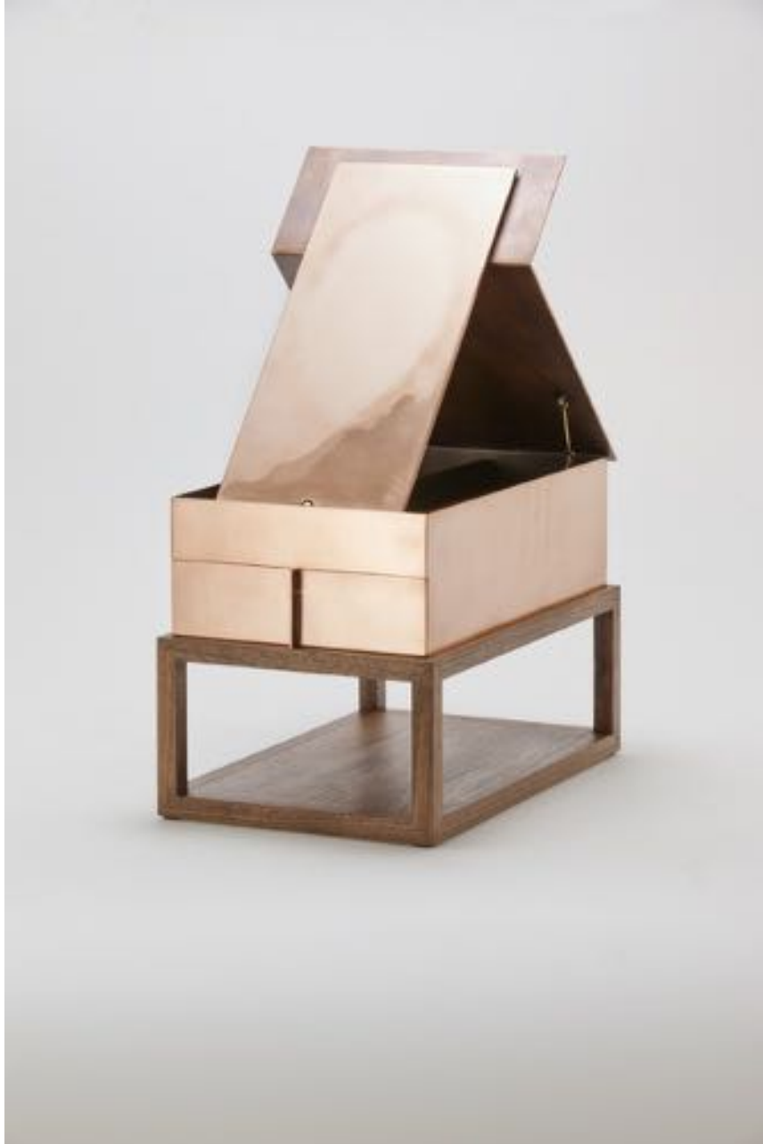
Trans-15apr-02 Walnut, Zelkova, Ebony, Copper 27W x 42.6D x 30H cm 2015