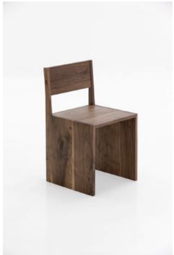
Walnut 37W x 44D x 80H cm 2012