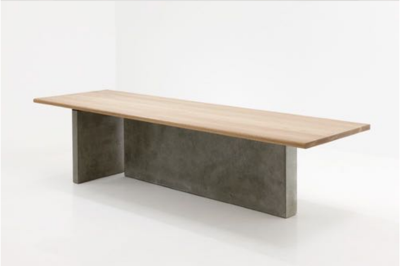
Dining Table for 12 persons White oak, preform casted concrete 300W x 90D x 74H cm 2012