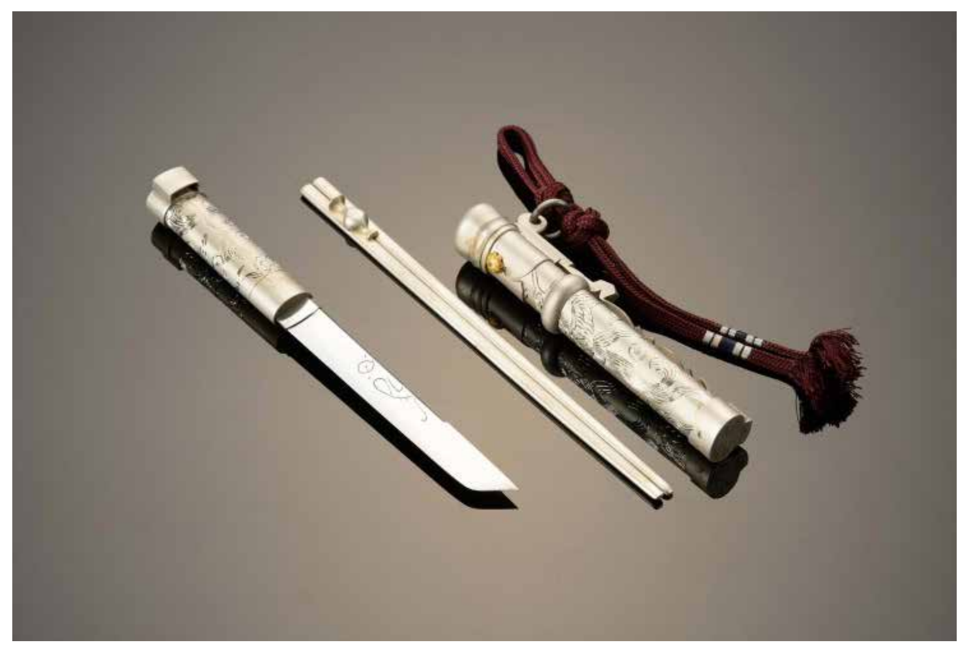
Geum Eun-jangdo with silver chopsticks gold, silver, stainless steel, pine resin 180mm