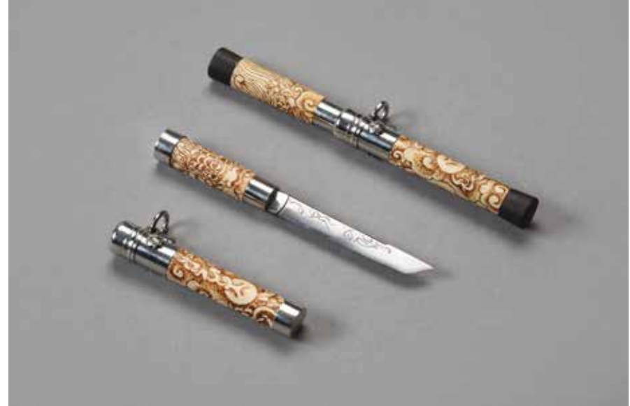
Baekdong Nakjuk Jangdo nakjuk, nickel, stainless steel, pine resin 120mm