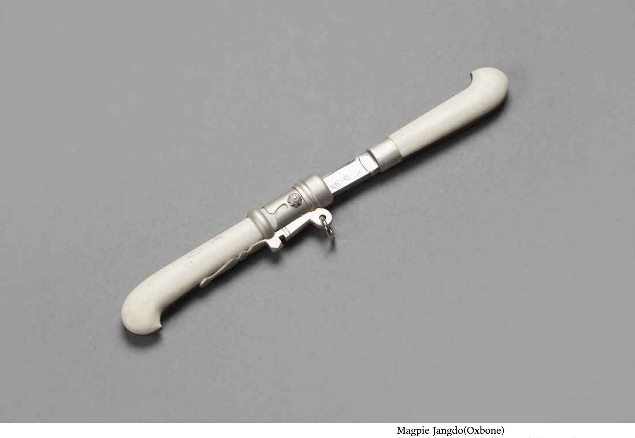
Magpie Jangdo(Oxbone) oxbone, jujube tree, silver, stainless steel, pine resin 160mm