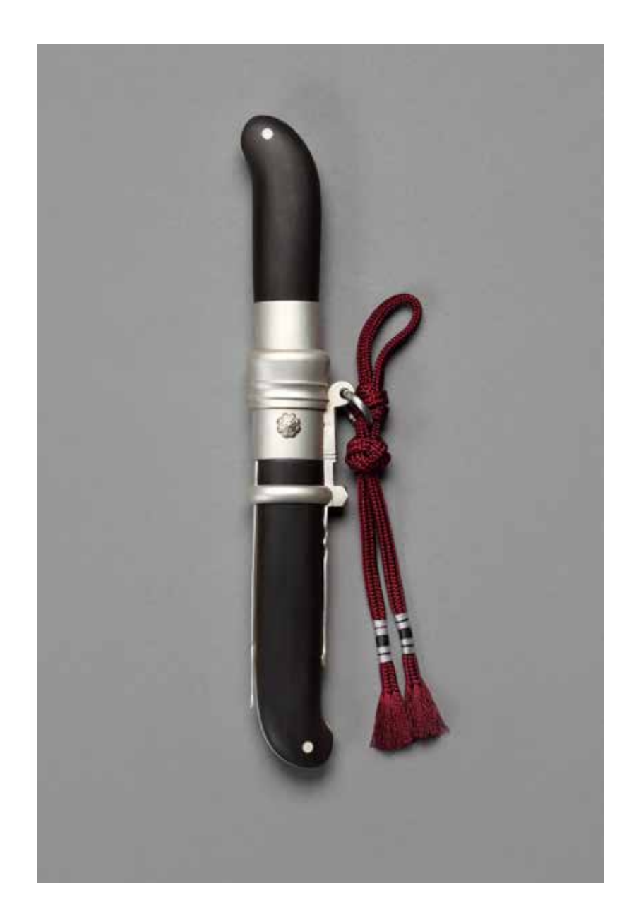
Magpie Jangdo (ebony) silver, ebony, oxbone, stainless steel, nickel, pine resin 240mm