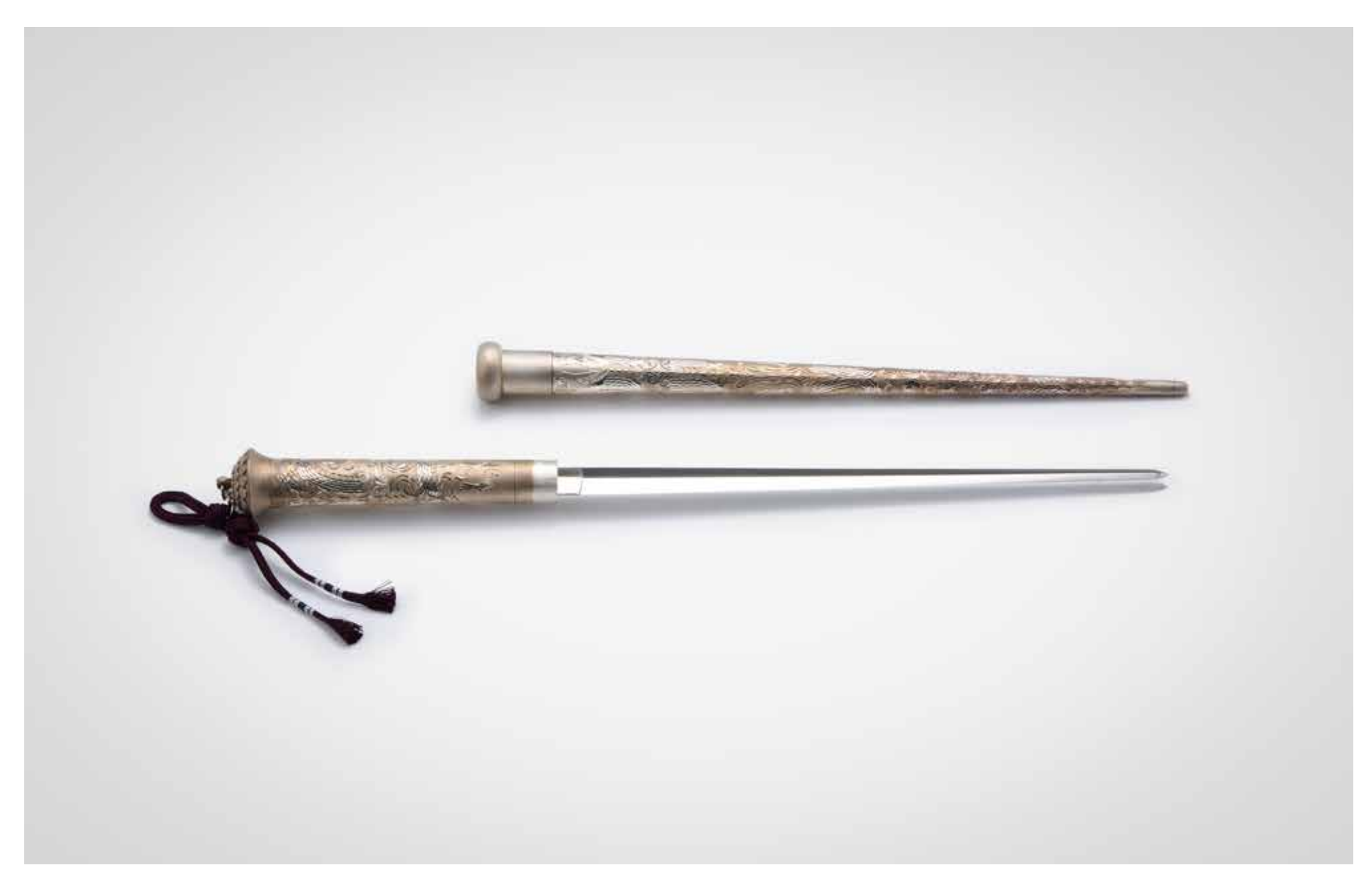
Dragon embellished Jangdo silver, stainless steel, pine resin 570mm