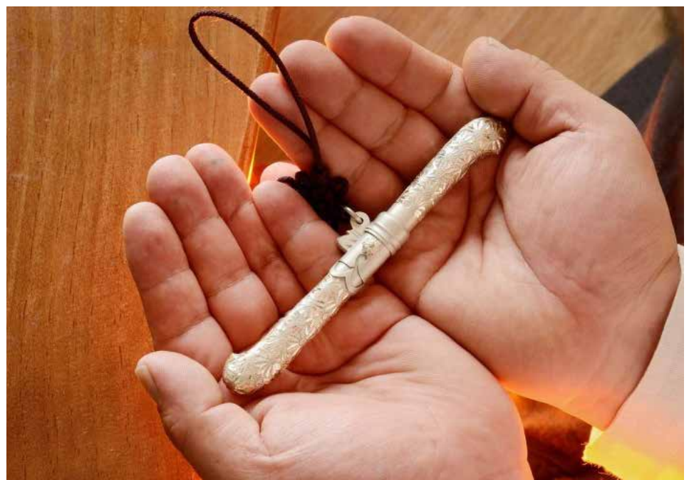
Bird and Tree emblished Jangdo gold, silver, stainless steel, pine resin 160mm