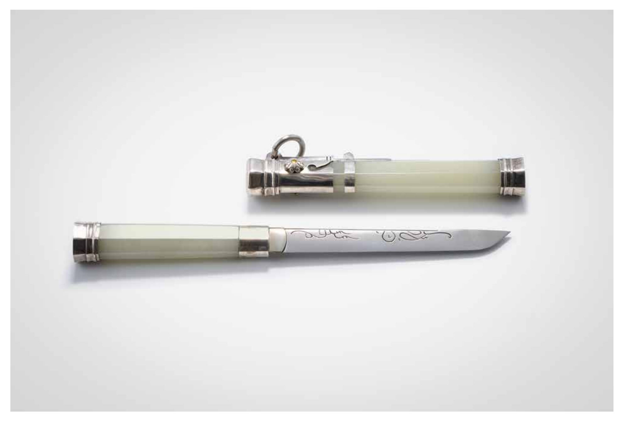
White jade octagonal Jangdo white jade, gold, silver 200mm