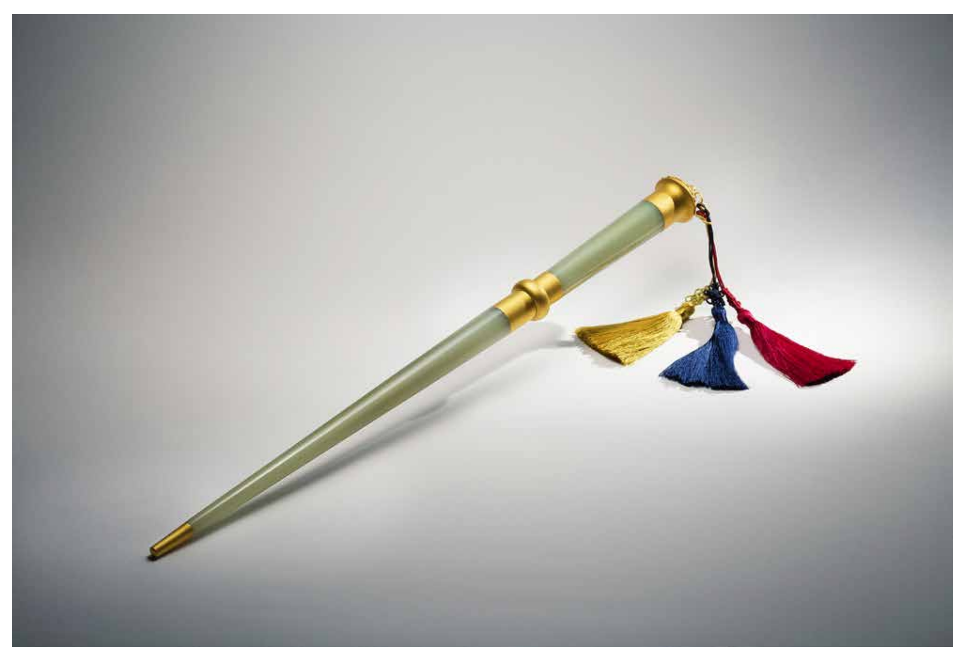
Gold inlaid sword jade, gold, stainless steel, pine resin 570mm