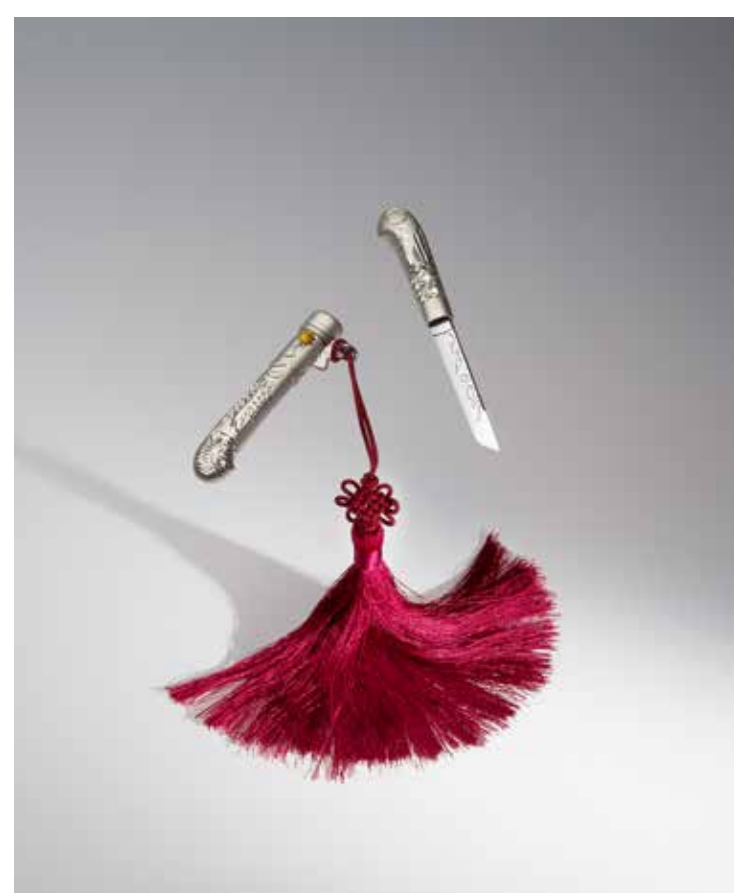
Jangdo with the ten traditional Symbol of longevity gold, silver, stainelss steel, pine resin 120mm