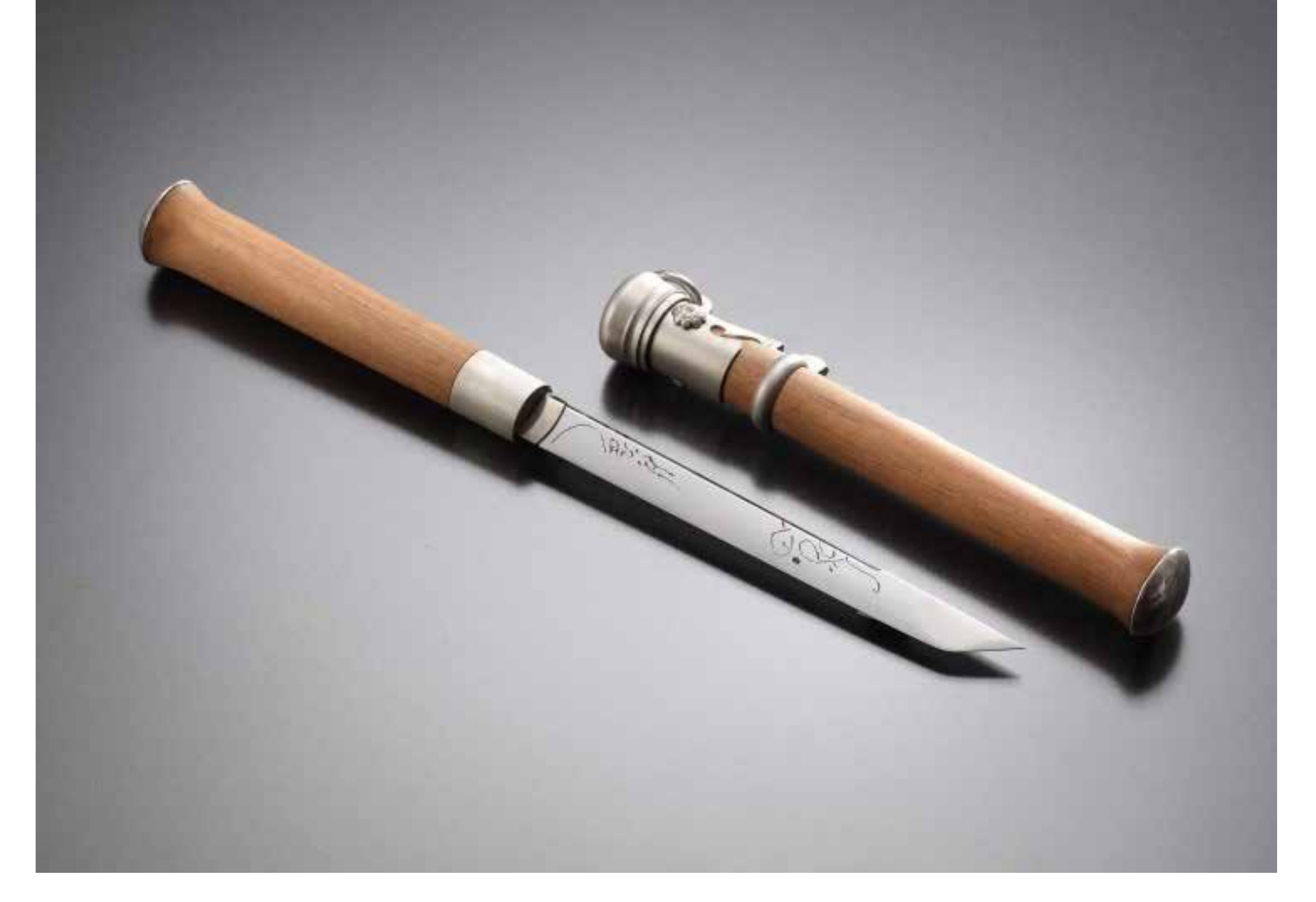
schmidts birch cylindrical Jangdo schmidts birch , silver, stainless steel, pine resin 290mm