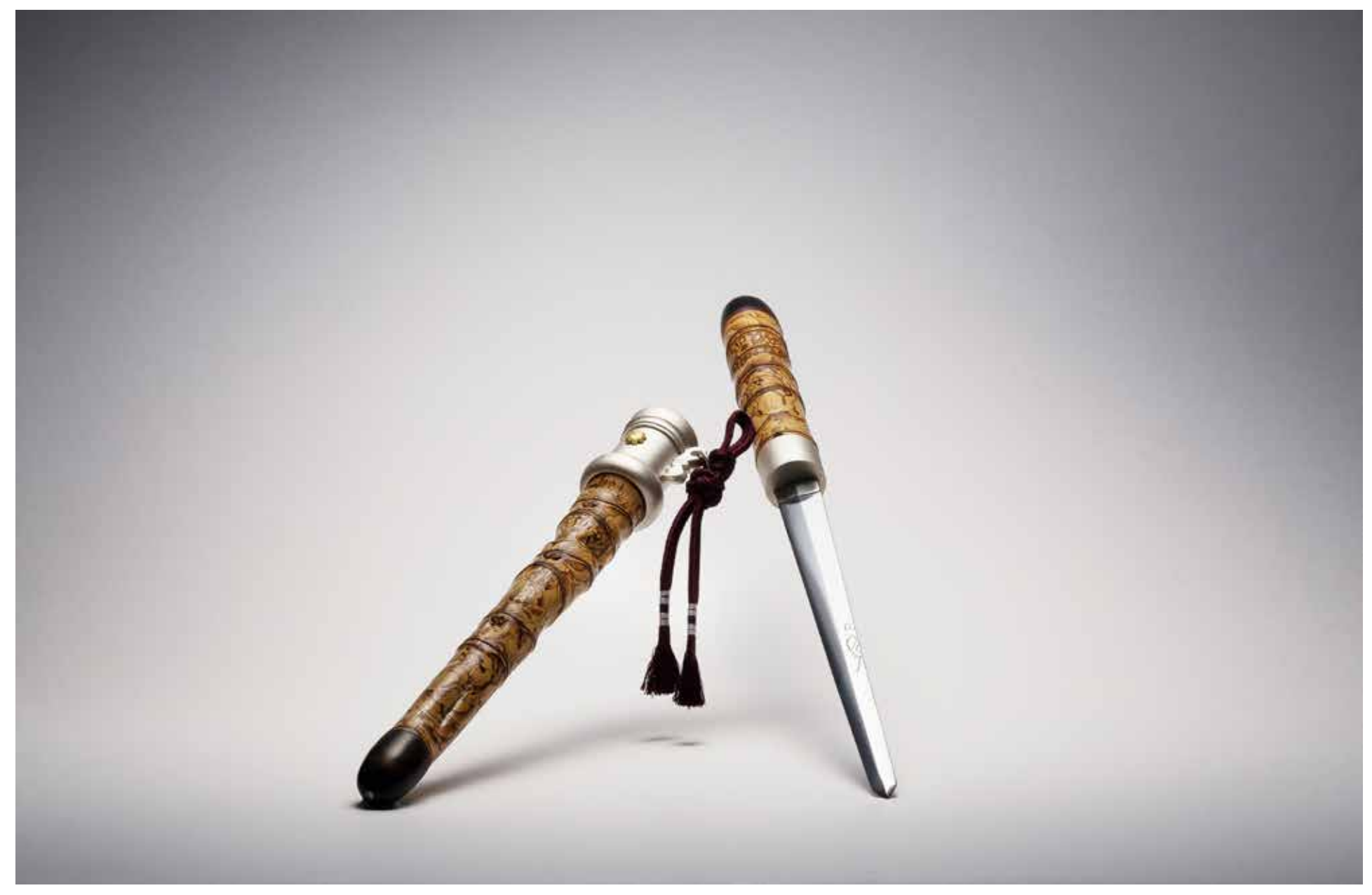
Nakjuk: Decorative technique to make a pattern by searing the surface of bamboo with hot iron.