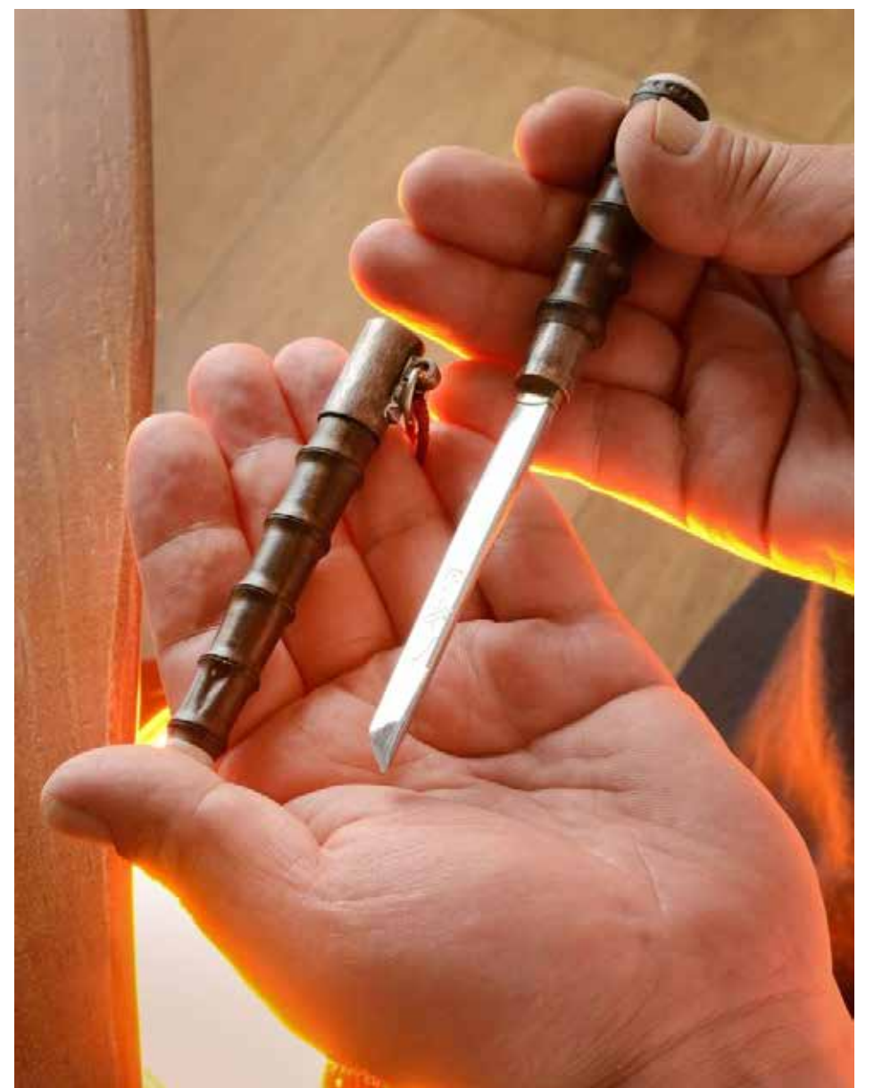
Bamboo embellished Jangdo ebony, oxbone, stainless steel, pine resin 280mm