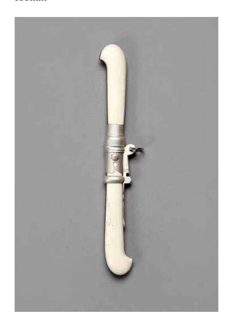
Magpie Jangdo(Oxbone) oxbone, jujube tree, silver, stainless steel, pine resin 160mm