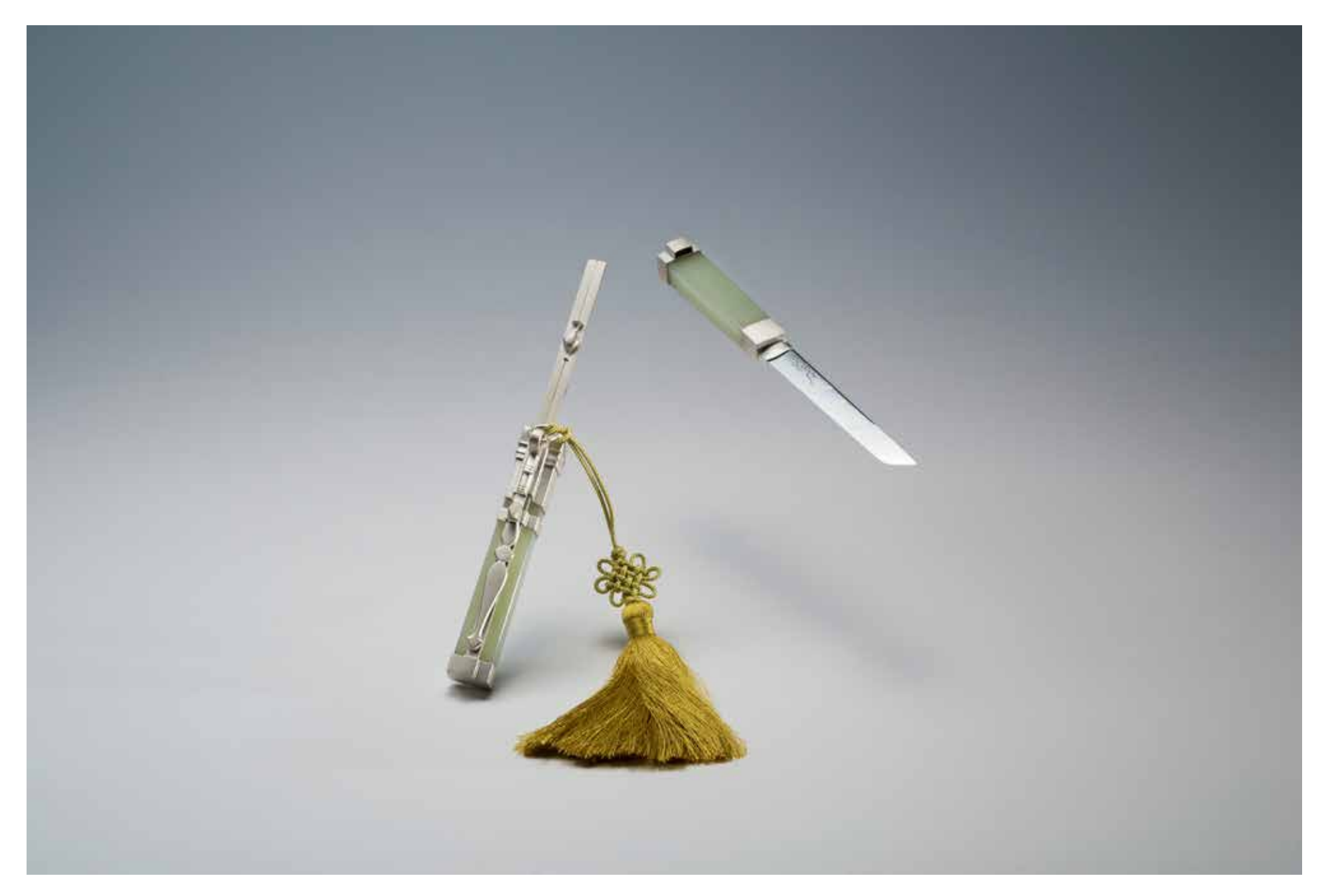
White jade Jangdo with silver chopsticks white jade, gold, silver, stainless steel, pine resin 200mm