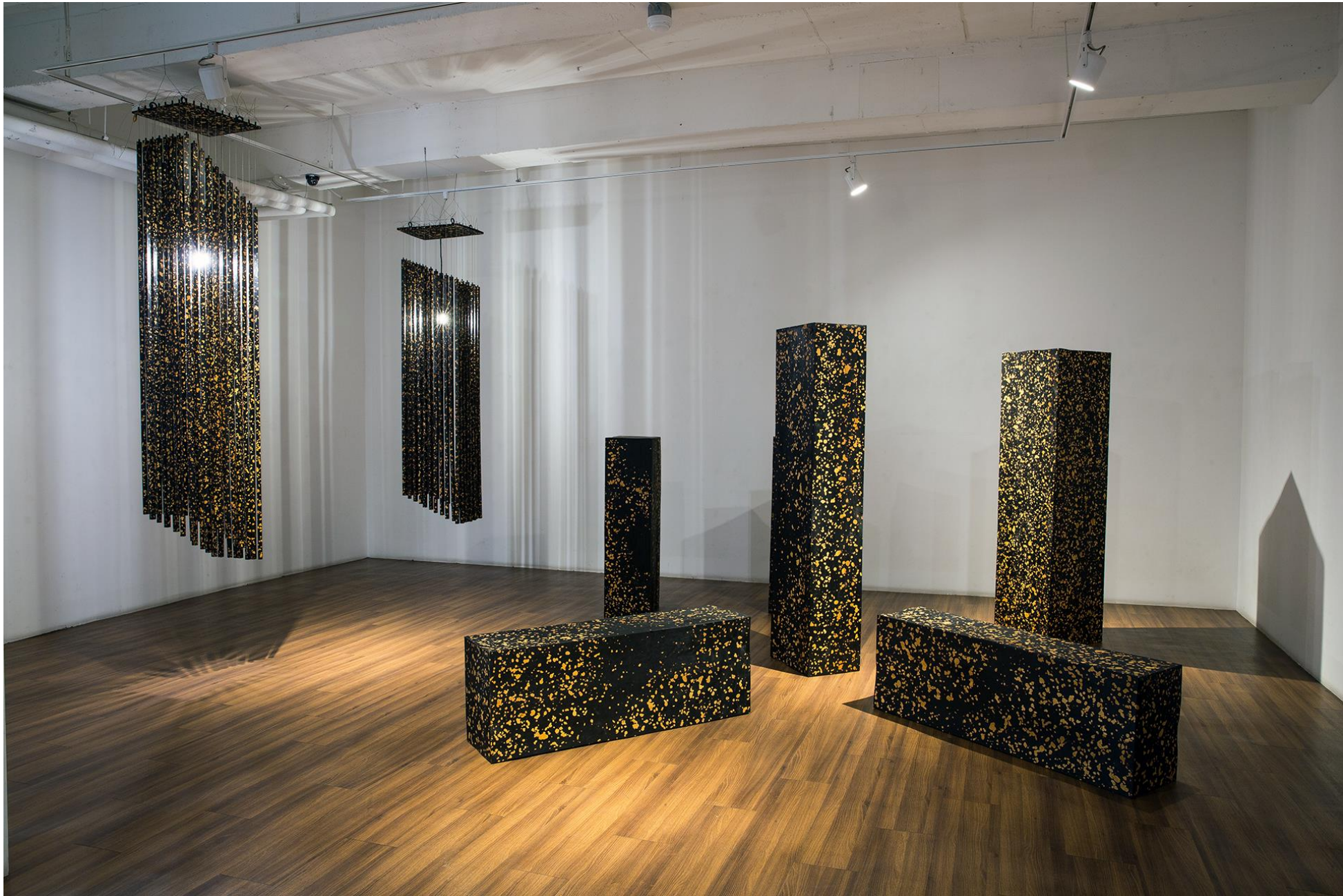
추상탄화 (Abstract Ignition), 2016