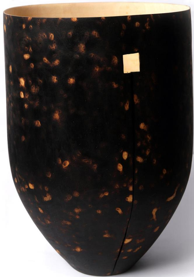
추상탄화 항아리 (Abstract Ignition – Jar), 2015