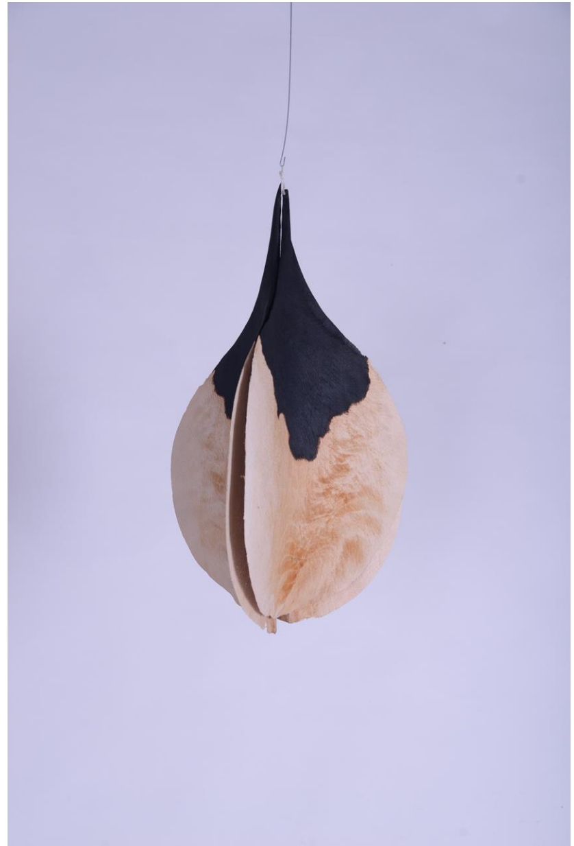
추상탄화 2020 (Abstract Ignition 2020)