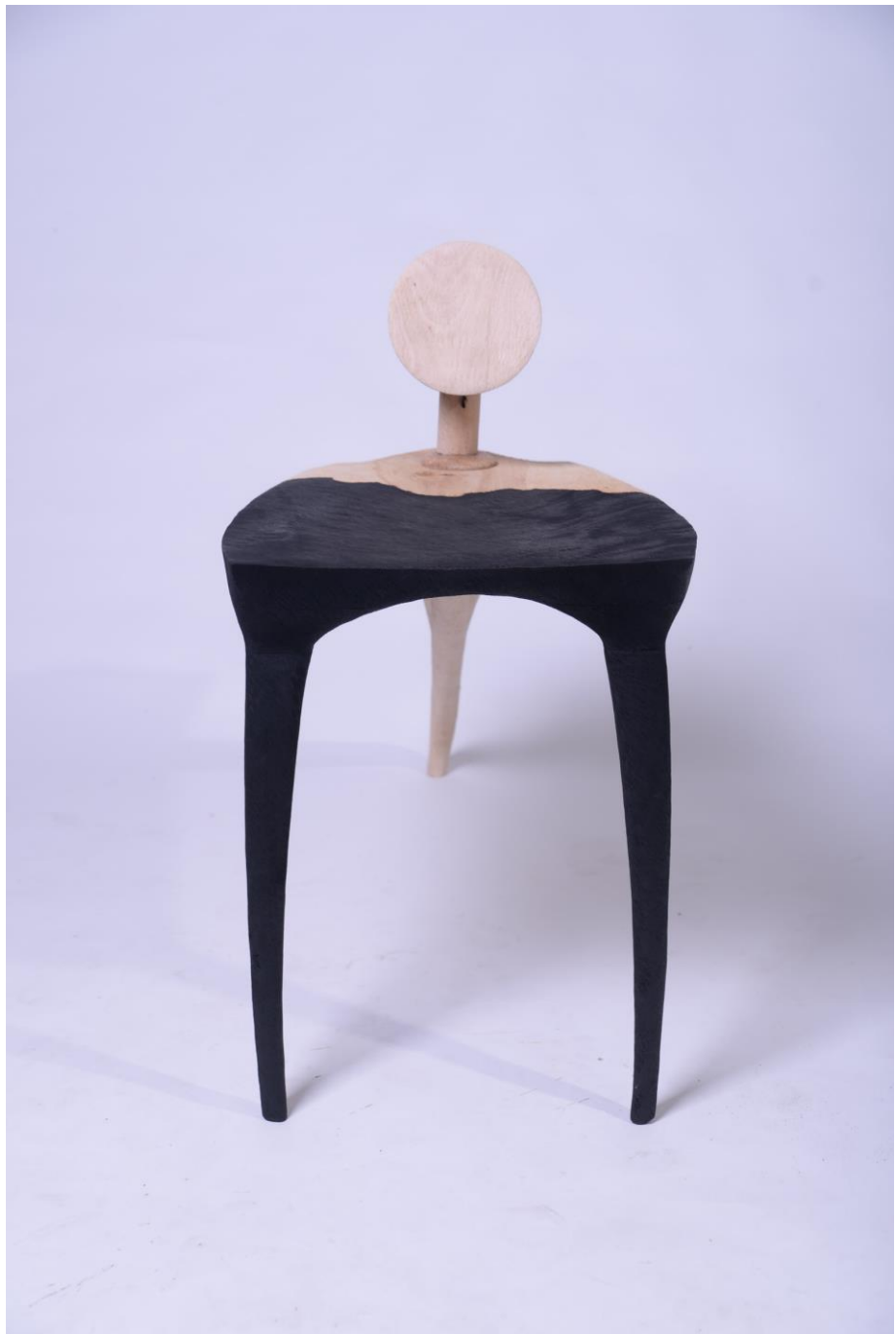
추상탄화 2020 (Abstract Ignition 2020)