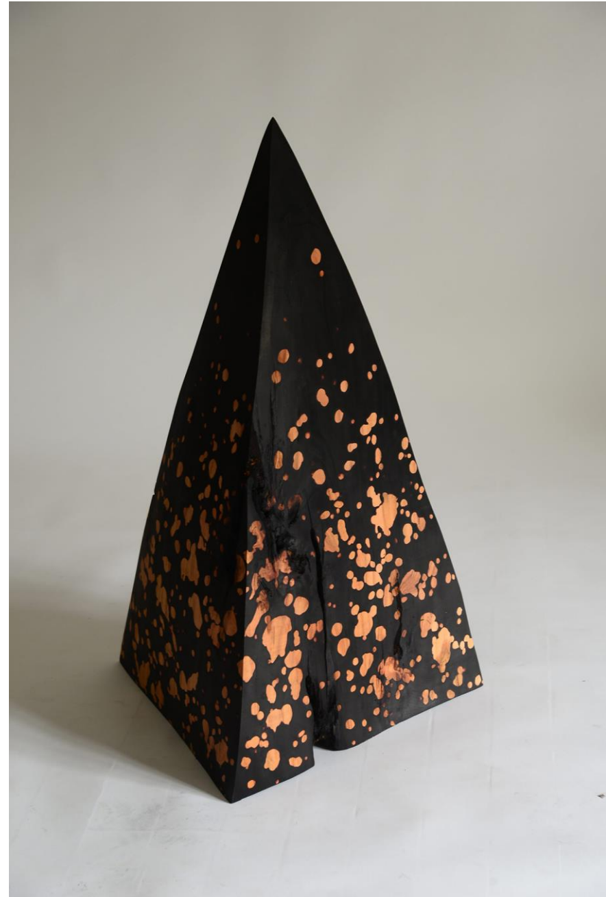
나머지 (What is left ), 2017