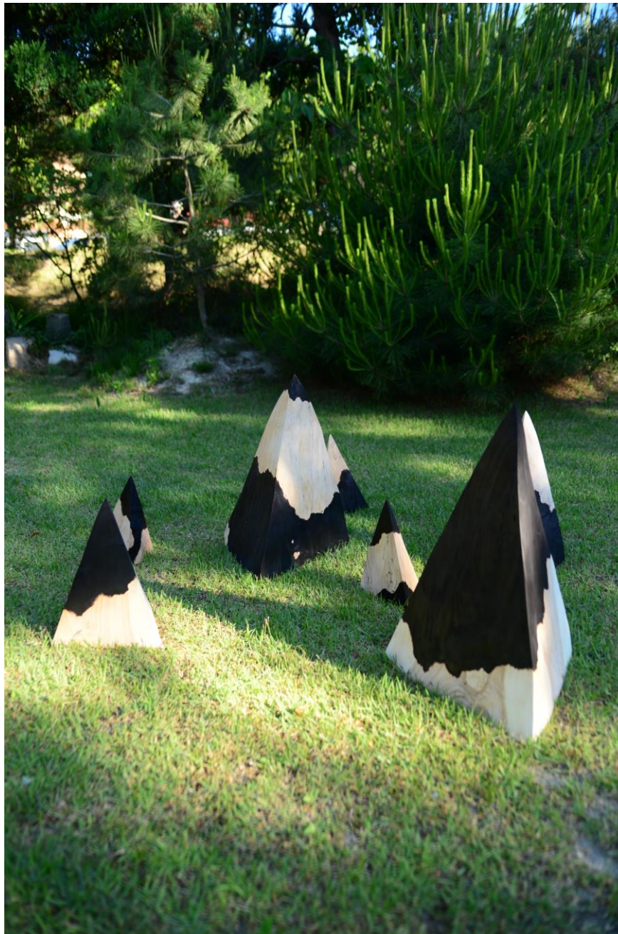
나머지 (What is left ), 2017