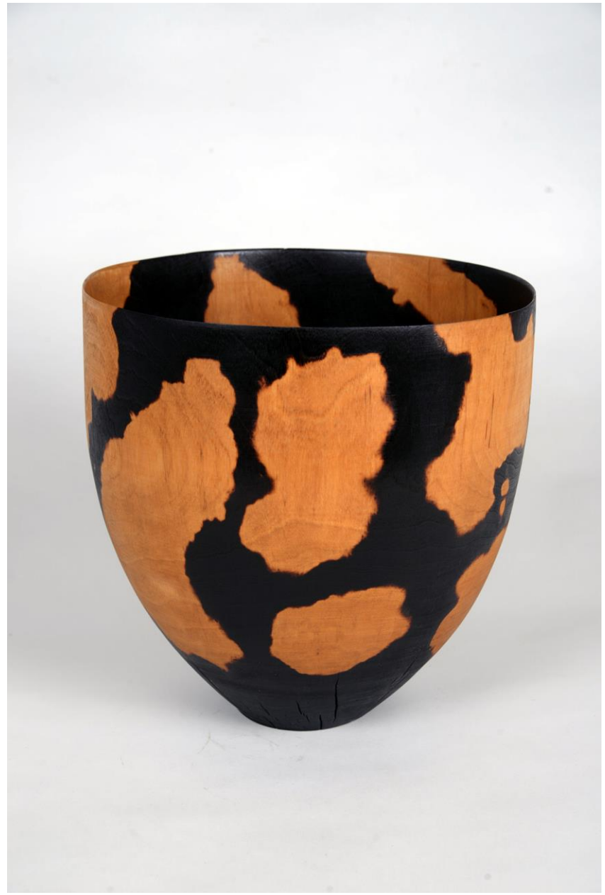
추상탄화 항아리 (Abstract Ignition - Jar), 2015