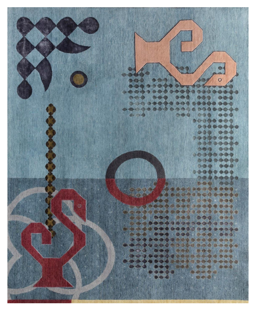
AKWB-7004 Balsam Green 1177-83 Denim Ash 2157-83