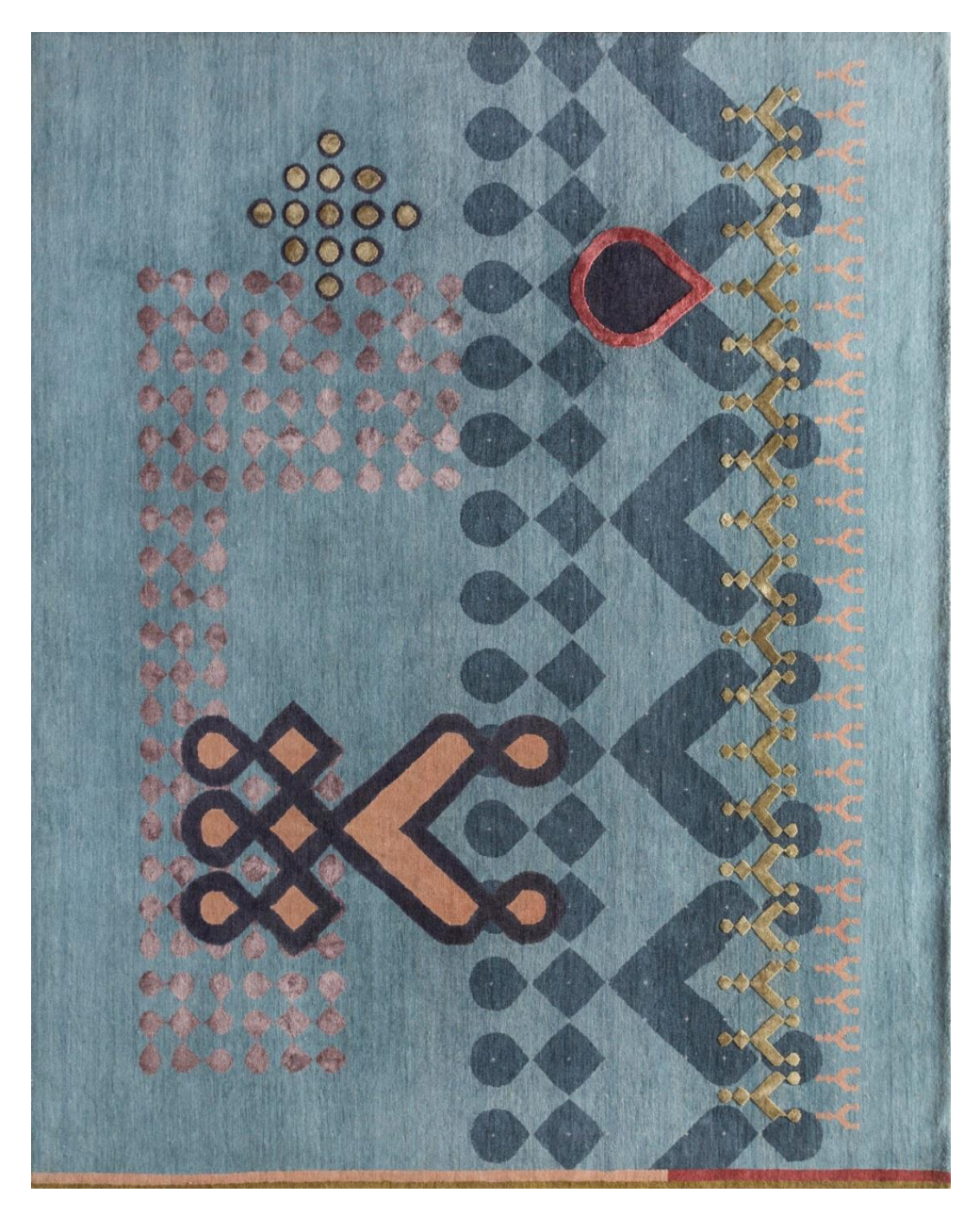
AKWB-7003 Seaside Blue 0166-83 Seaside Blue 0166-83