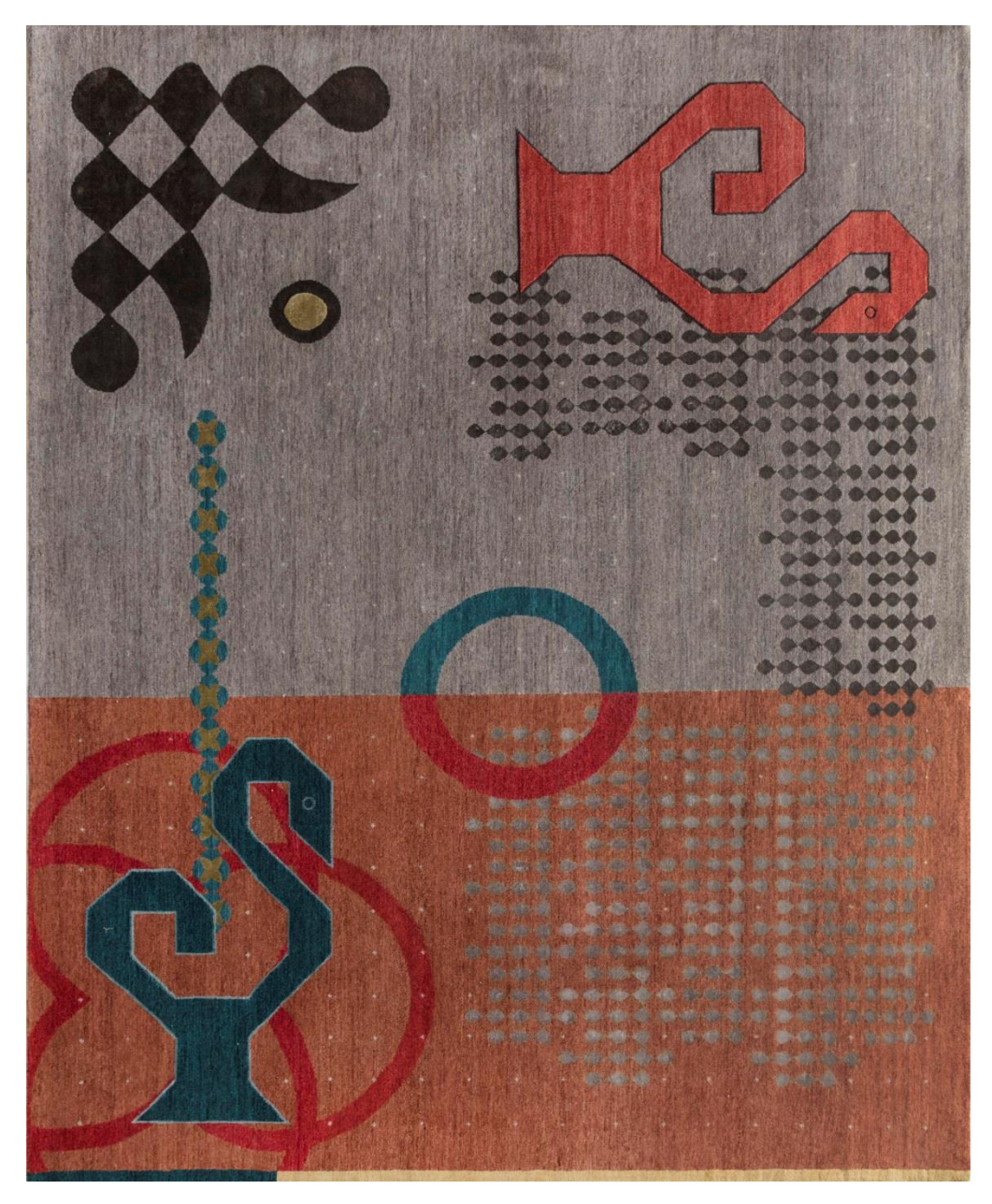
AKWB-7004 Dark Gray 0521-83 Russet 0625-83