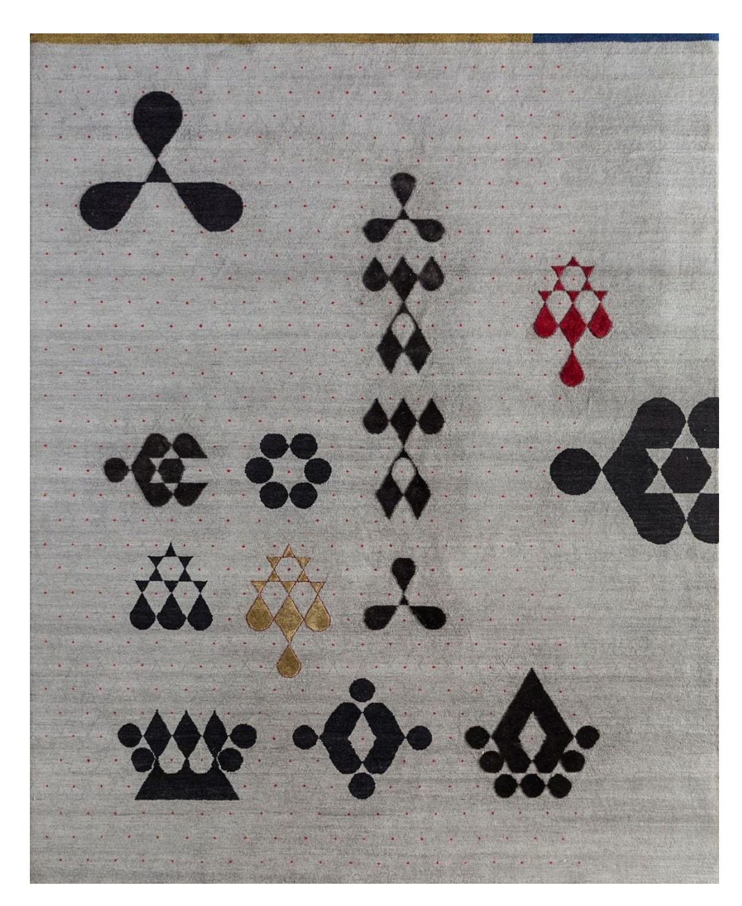
AKWB-7001 Classic Gray 0959-83 Caviar 2171-83