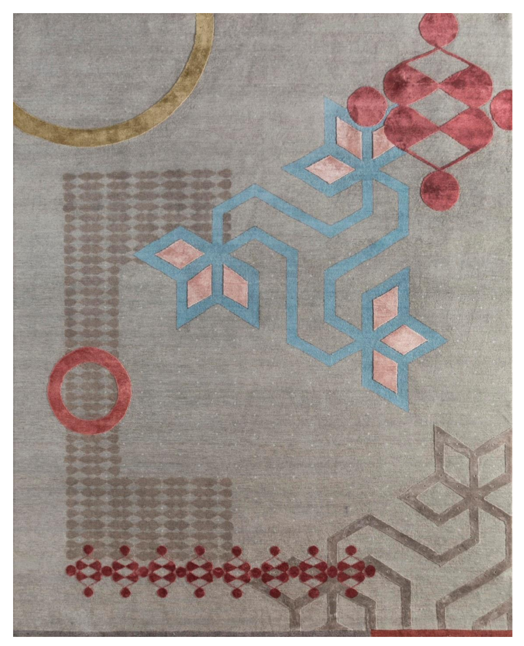
AKWB-7002 Classic Gray 0959-83 Classic Gray 0959-83