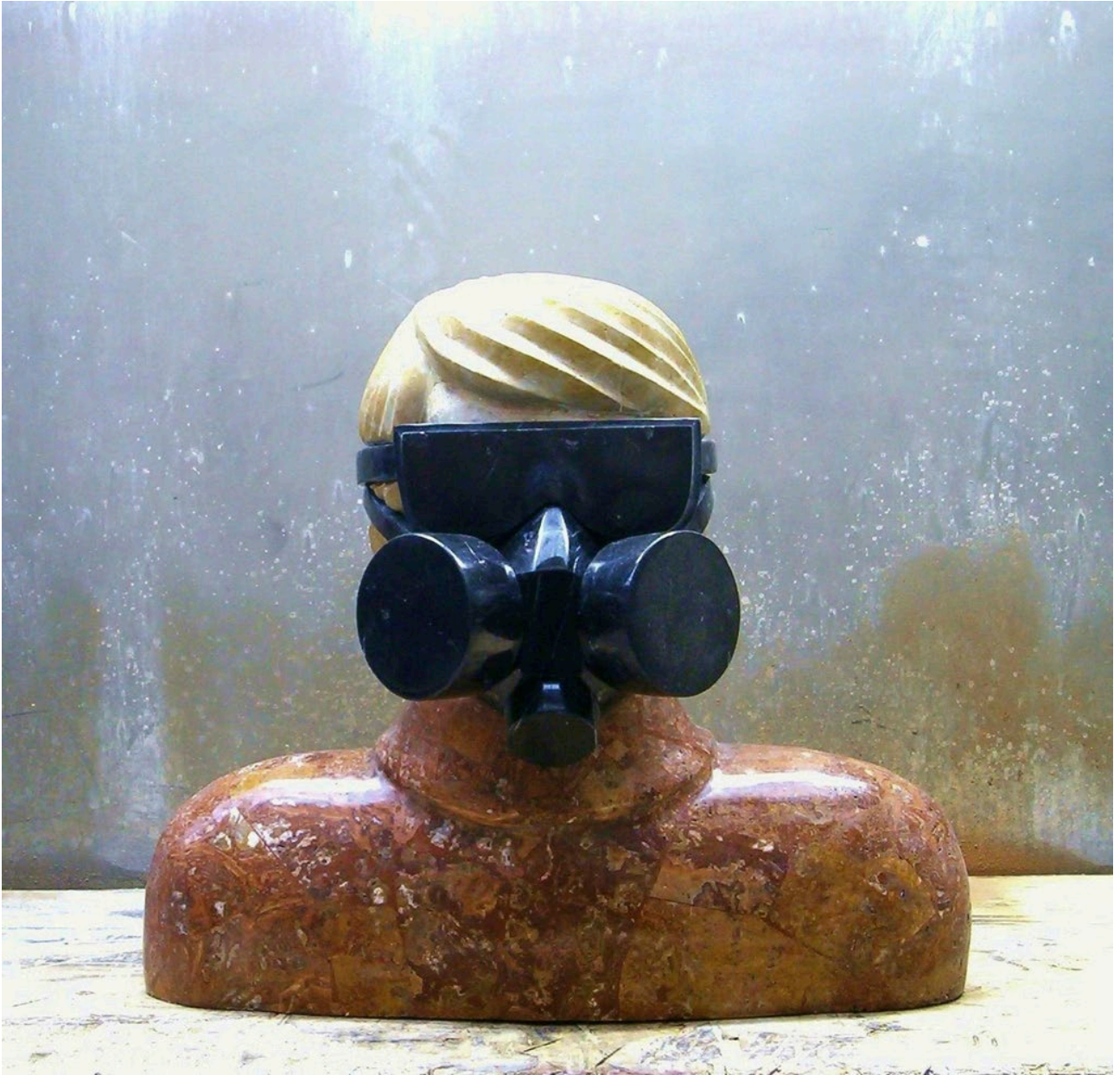
Still Life, 2011.