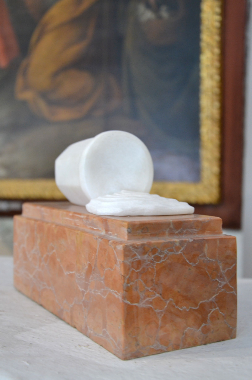
The Error, work of Marble, 2021