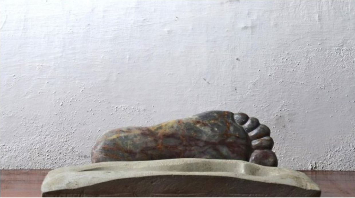
Footprint, Recycled Marble 35 × 40 × 15 cm