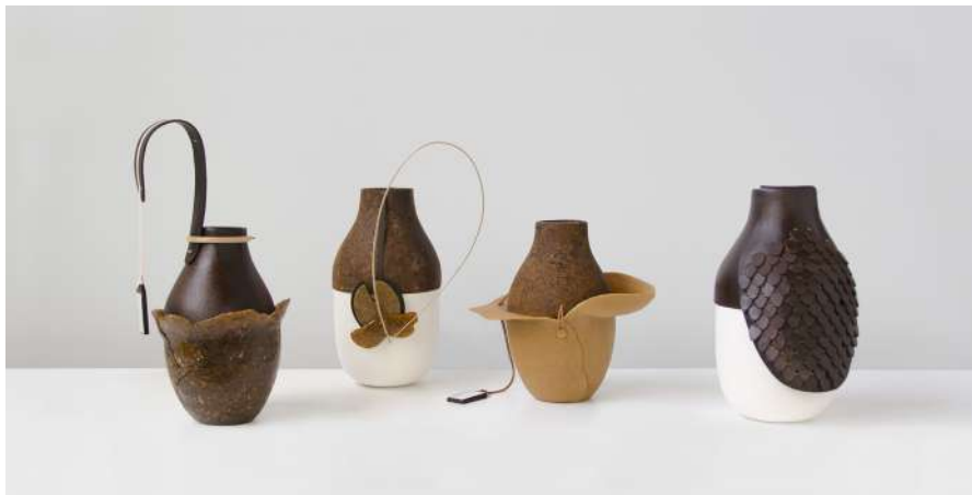
Tamara Orjola Forest Wool , 2016

Photo by Ronald Smits © Design Academy Eindhoven