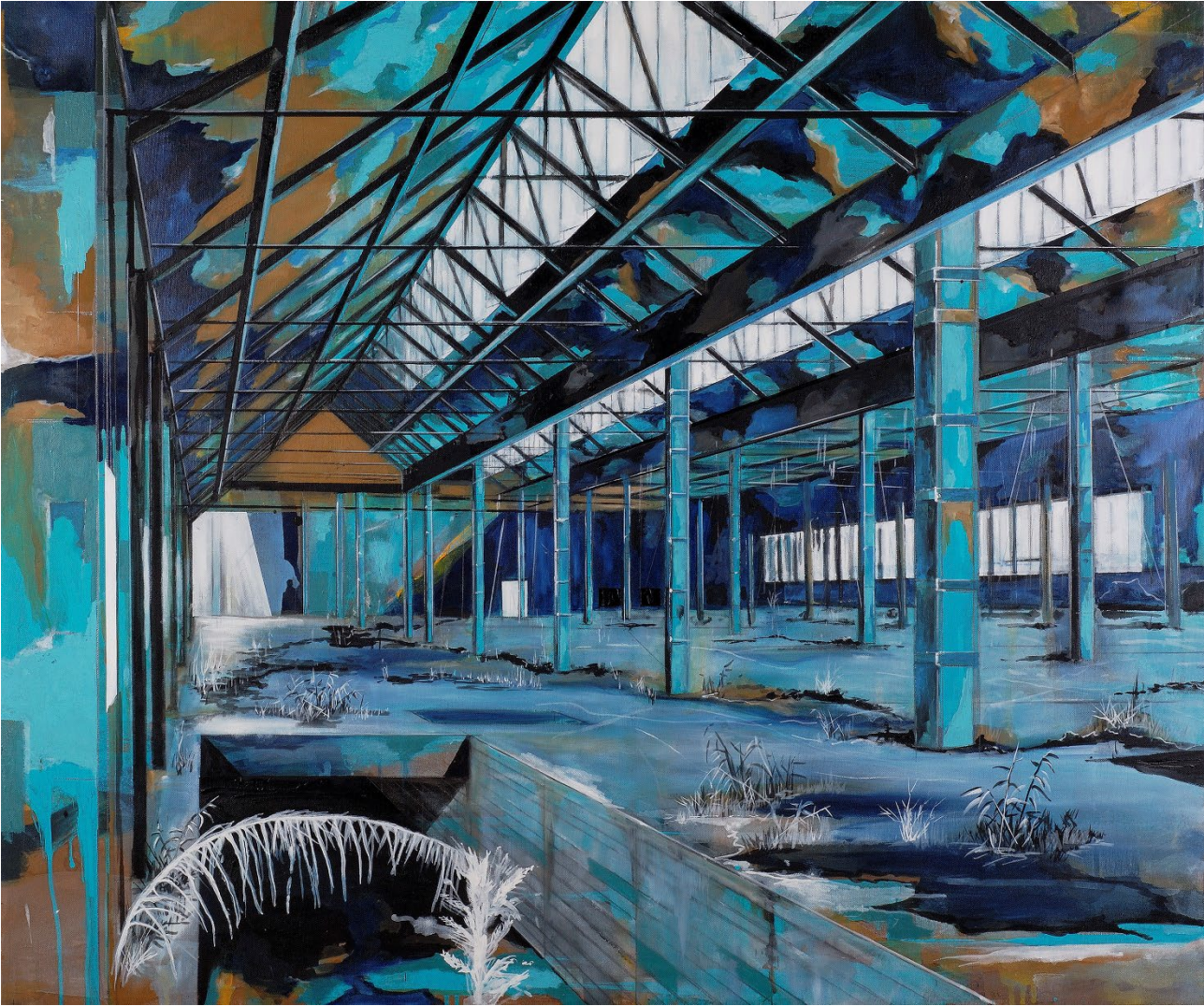
Vorhalle, 100X120, Oil on canvas, 2008