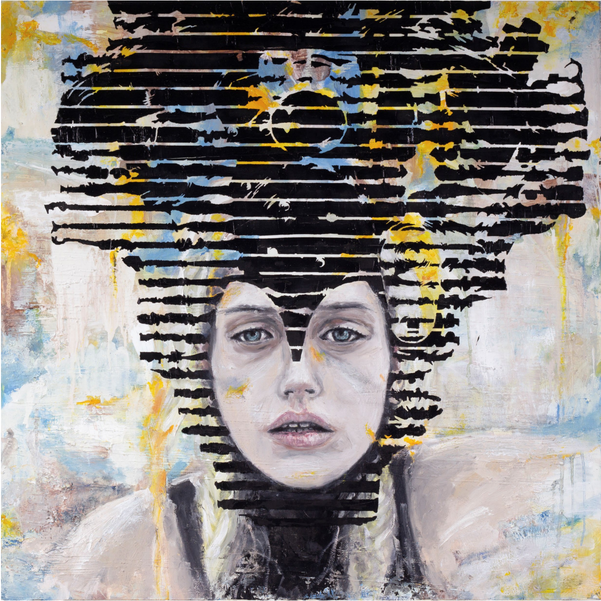
Frau mit Motor, 100X100, Oil on canvas, 2021