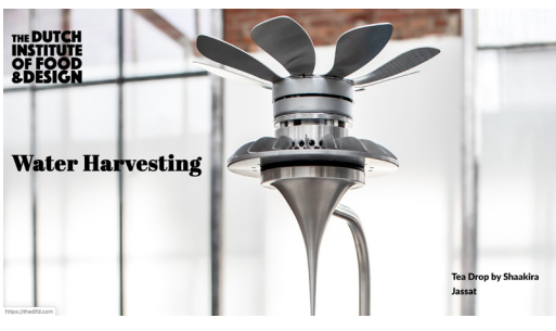
Dutch Institute of Food and Design